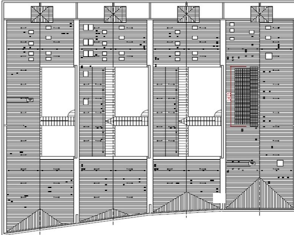
PHOTO OF PROPOSED LOCATION