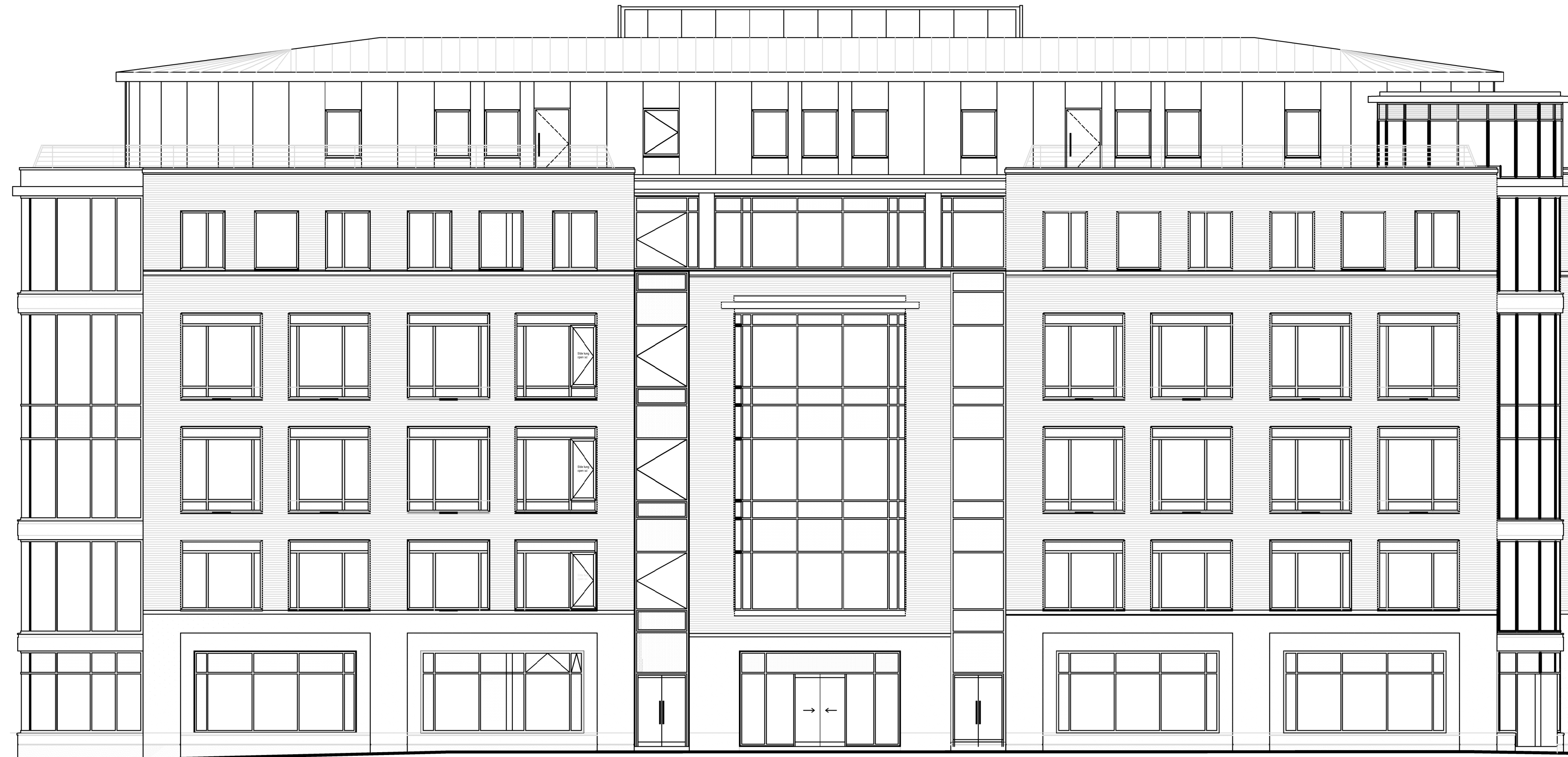
COUNTERSLIP STREET ELEVATION