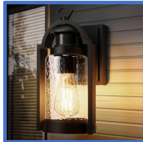
★ Light fixture- Aluminium Exterior Wall Lantern