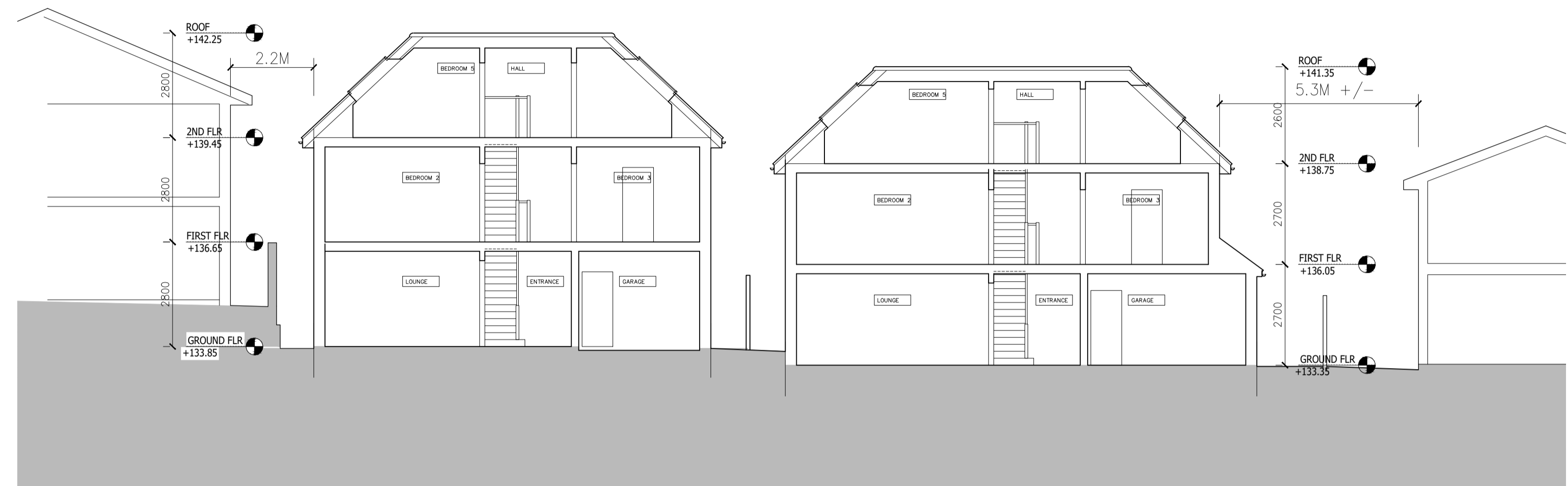
1 PROPOSED CROSS SECTION A-A 1 : 100

THIS DRAWING AND ANY DESIGNS INDICATED THEREON ARE THE COPYRIGHT OF THE ARCHITECT. ALL RIGHTS ARE RESERVED. NO PART OF THIS WORK MAY BE REPRODUCED WITHOUT PRIOR PERMISSION IN WRITING FROM THE ARCHITECT.