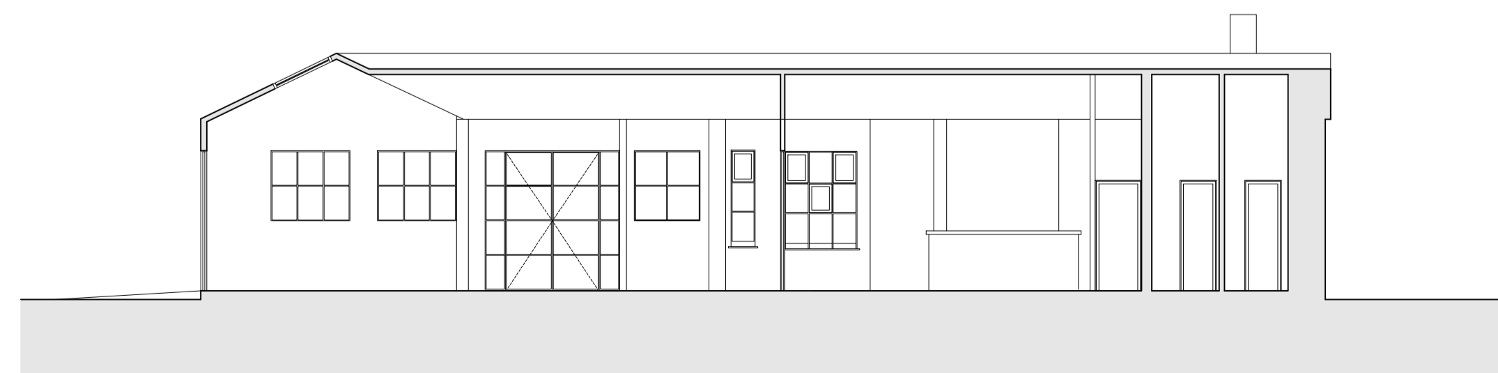
Existing Section BB