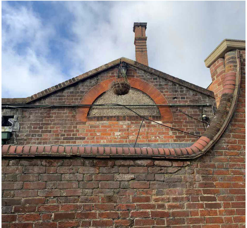
Figure 3 - External brickwork showing later alterations. (Survey Photo)