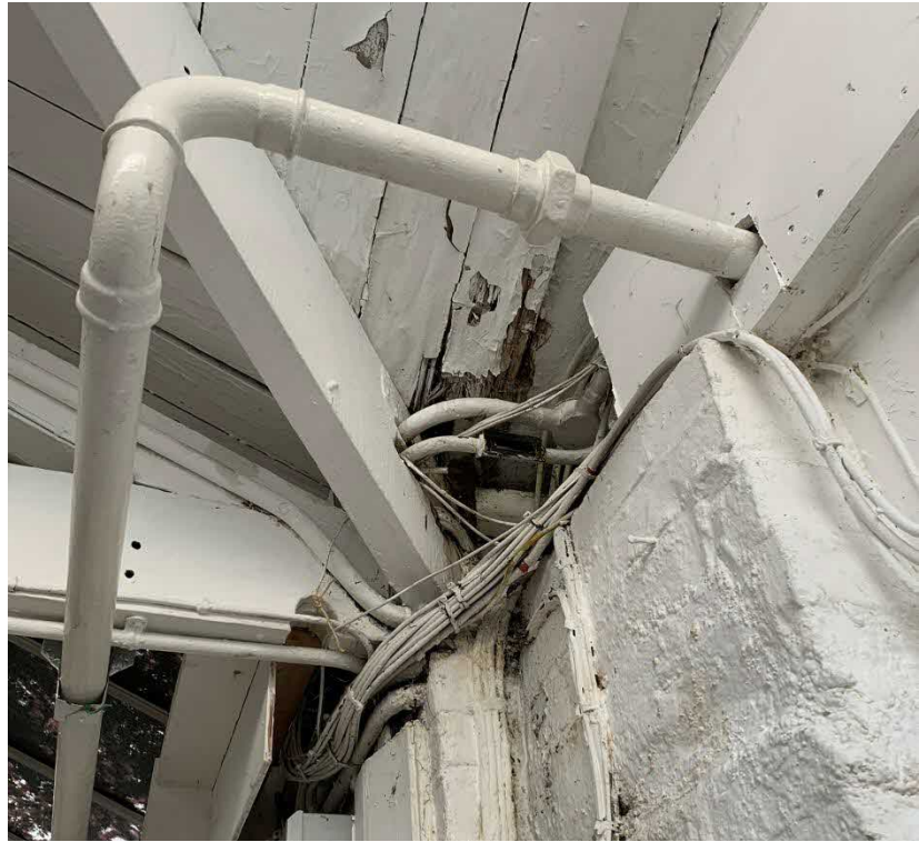
Figure 5 - Evidence of water ingress (Survey Photo)