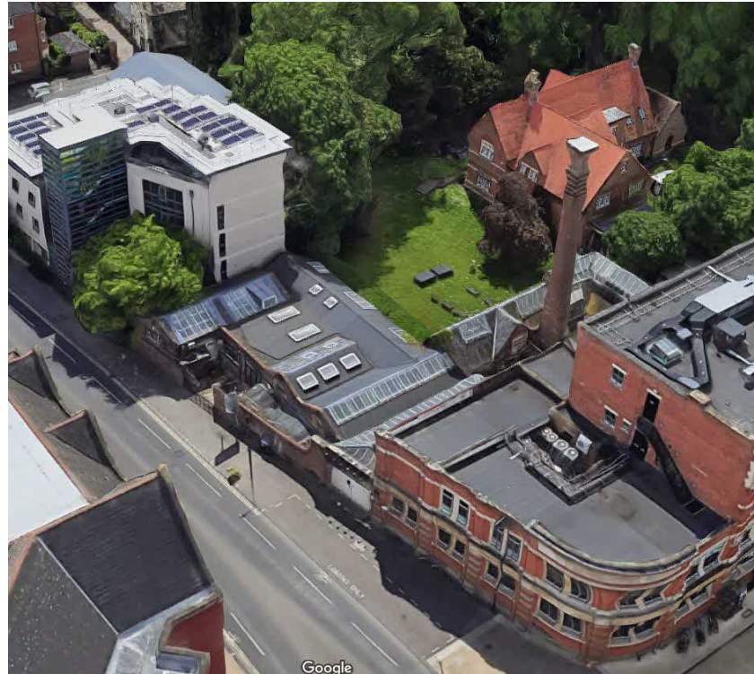
Figure 2 - The site