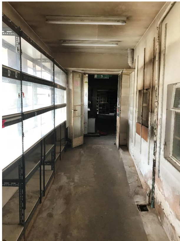
Photo 18 – Middle store/corridor. Floor laid to fall with drain gully.