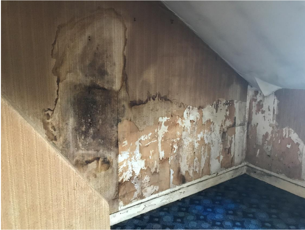
Photo 15 – Second Floor, Bedroom 3, rear. Damp penetration and decay to gable and rear wall.