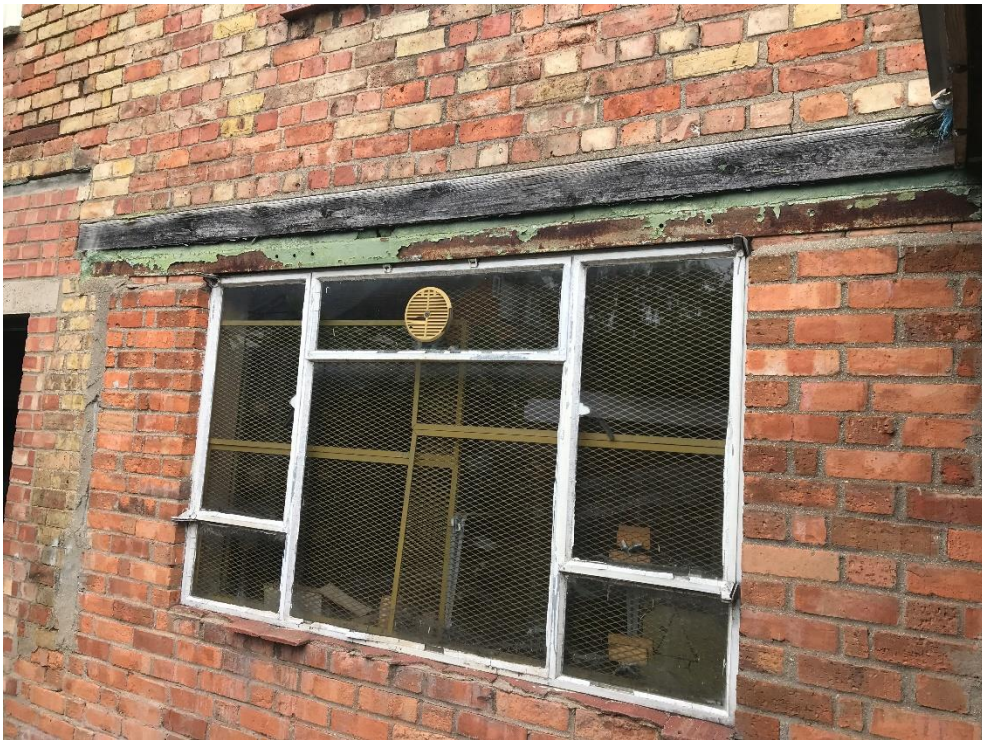
Photo 26 – Rear two storey building, south west elevation. Defective lintels and poor brick bonding, straight mortar jointing.