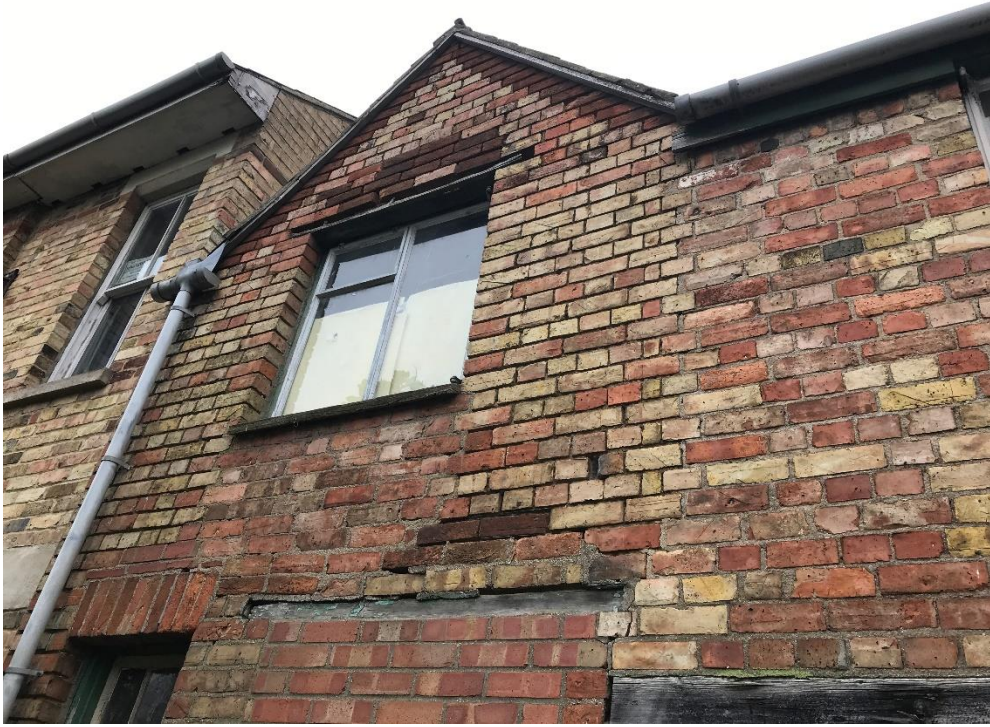
Photo 23 – Rear two storey building, south west gable. Defective lintels and poor brick bonding.