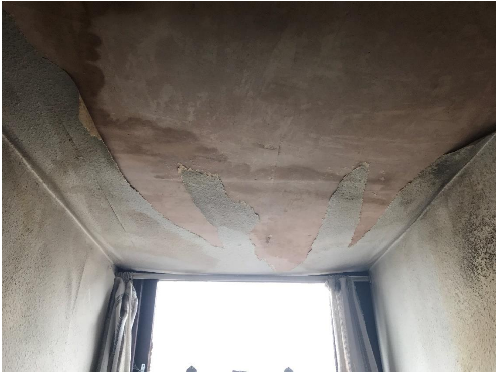
Photo 9 – Second Floor, Bedroom 1, front. Failing flat roof of front dormer.