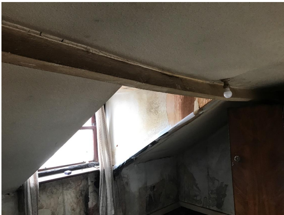
Photo 10 – Second Floor, Bedroom 1, front. Front dormer and undersized purlin, deflecting roof slope.