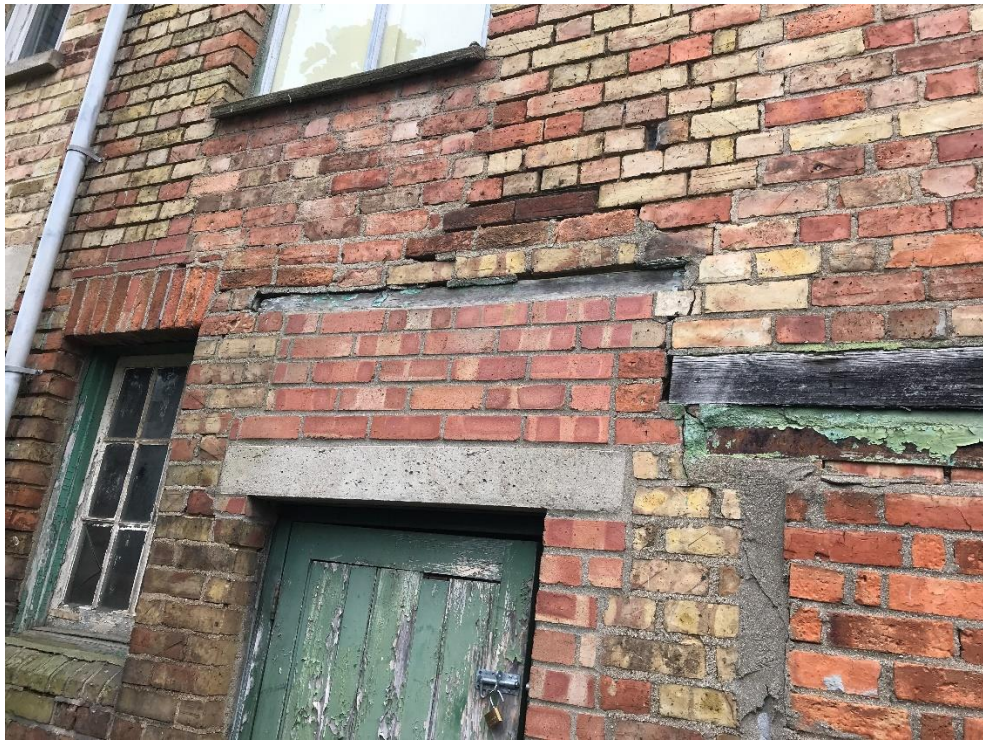
Photo 24 – Rear two storey building, south west elevation. Defective lintels and poor brick bonding.