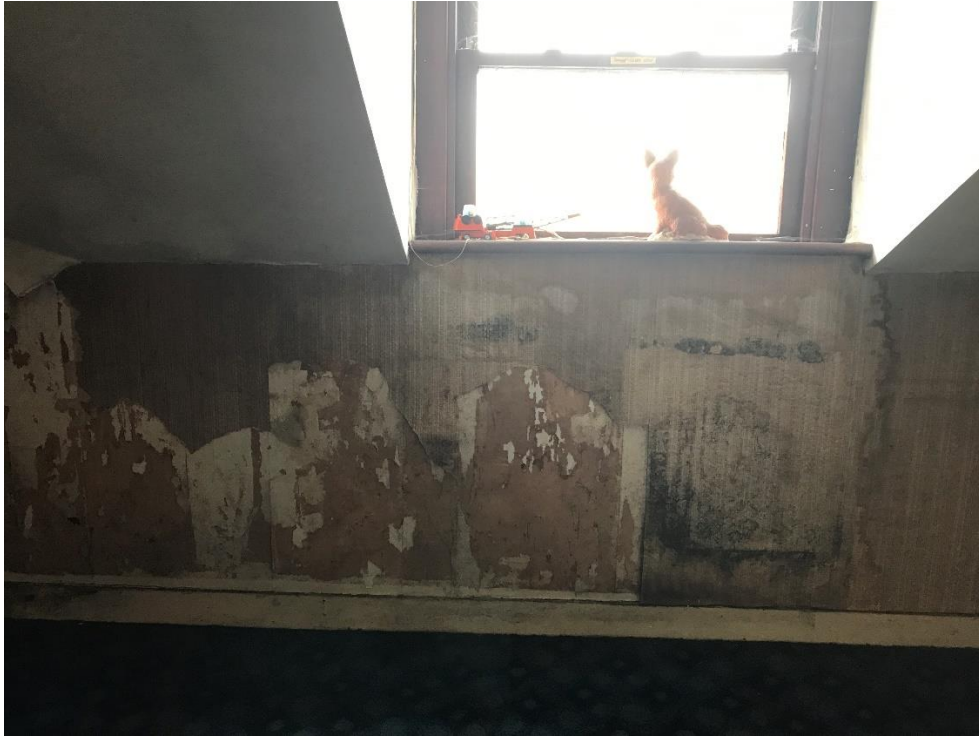
Photo 11 – Second Floor, Bedroom 1, front. Front wall, damp penetration, failed finishes and cracked brickwork exposed.