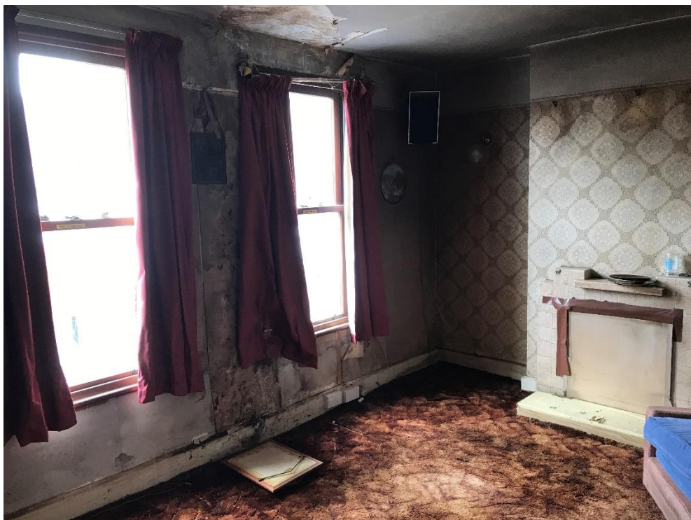
Photo 16 – First Floor, Sitting Room, front. Cracked brickwork below window sill and floor deflection.