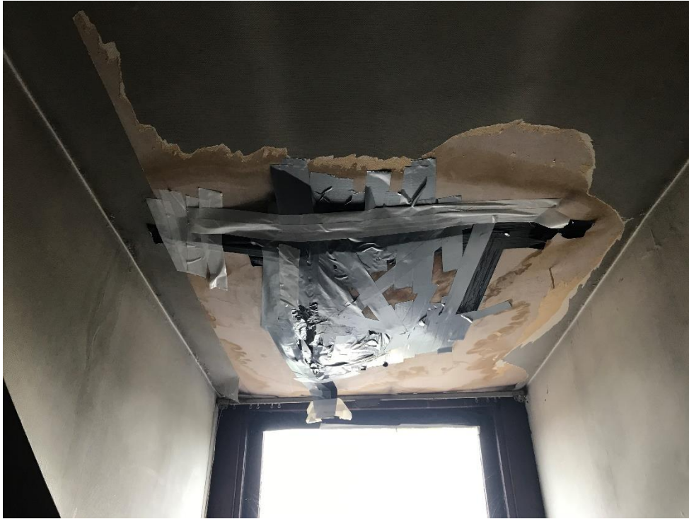
Photo 13 – Second Floor, Bedroom 3, rear. Failing flat roof of rear dormer.