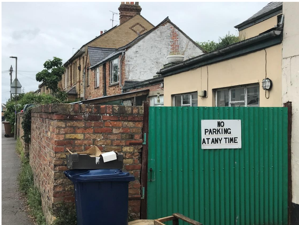
Photo 30 – South west boundary wall to Hurst Street and return to yard entrance.