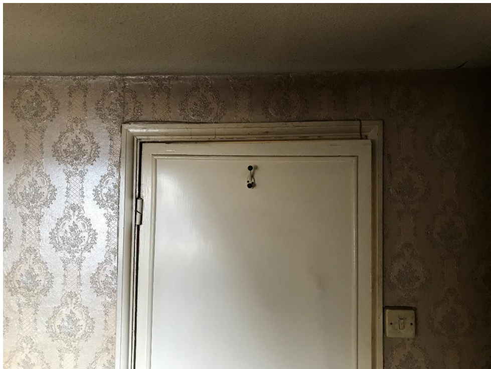
Photo 12 – Second Floor, Bedroom 1, front. Door head slope to south-west.