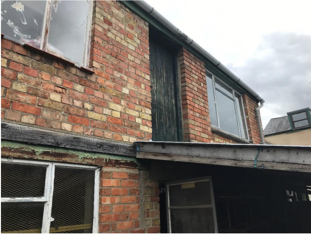
Photo 25 – Rear two storey building, south west elevation. Wall leaning outward either side of “fire escape” door.