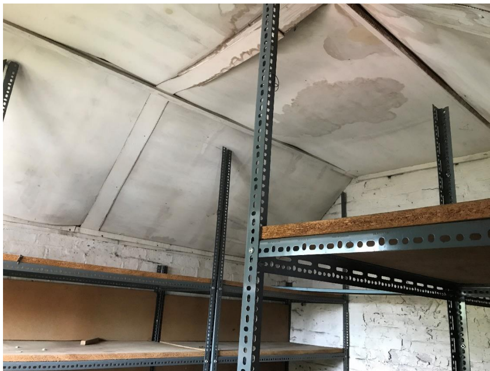
Photo 22 – Rear two storey building, roof over raised first floor to north.