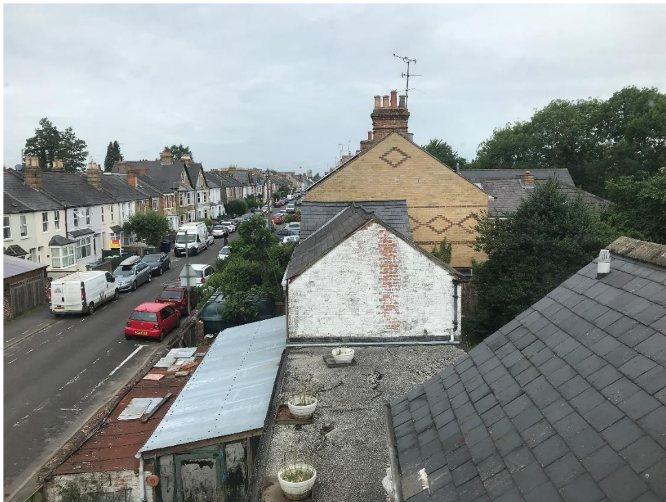
Photo 6 – View to north-west. Middle single storey flat roof, outbuilding & rear north two storey building.