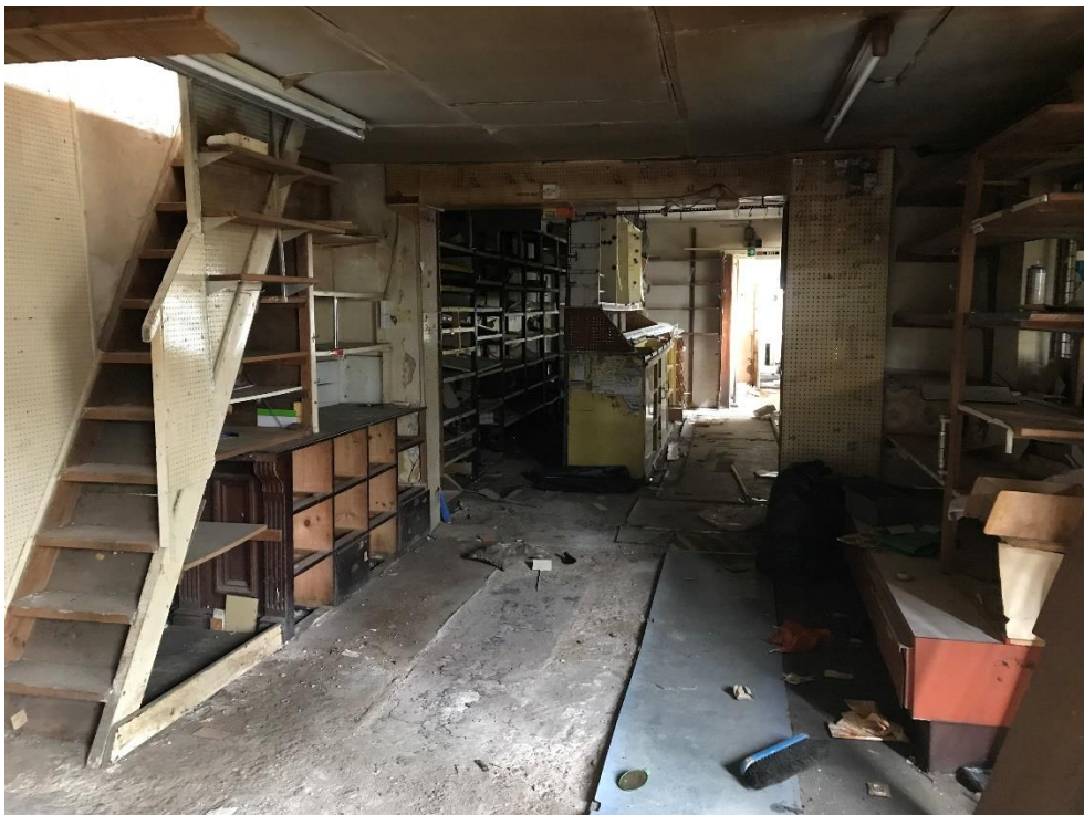
Photo 20 – Rear two storey building, ground floor and stair to first floor.