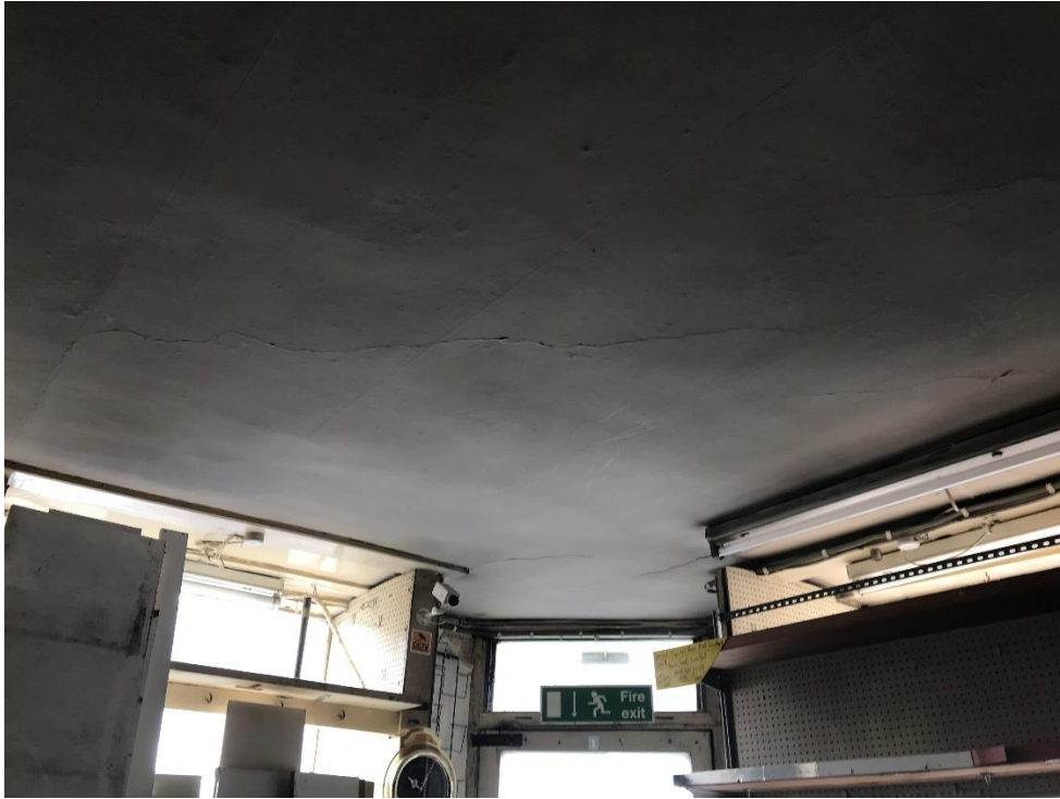
Photo 17 – Ground floor shop and front entrance. Diagonal cracking through ceiling.