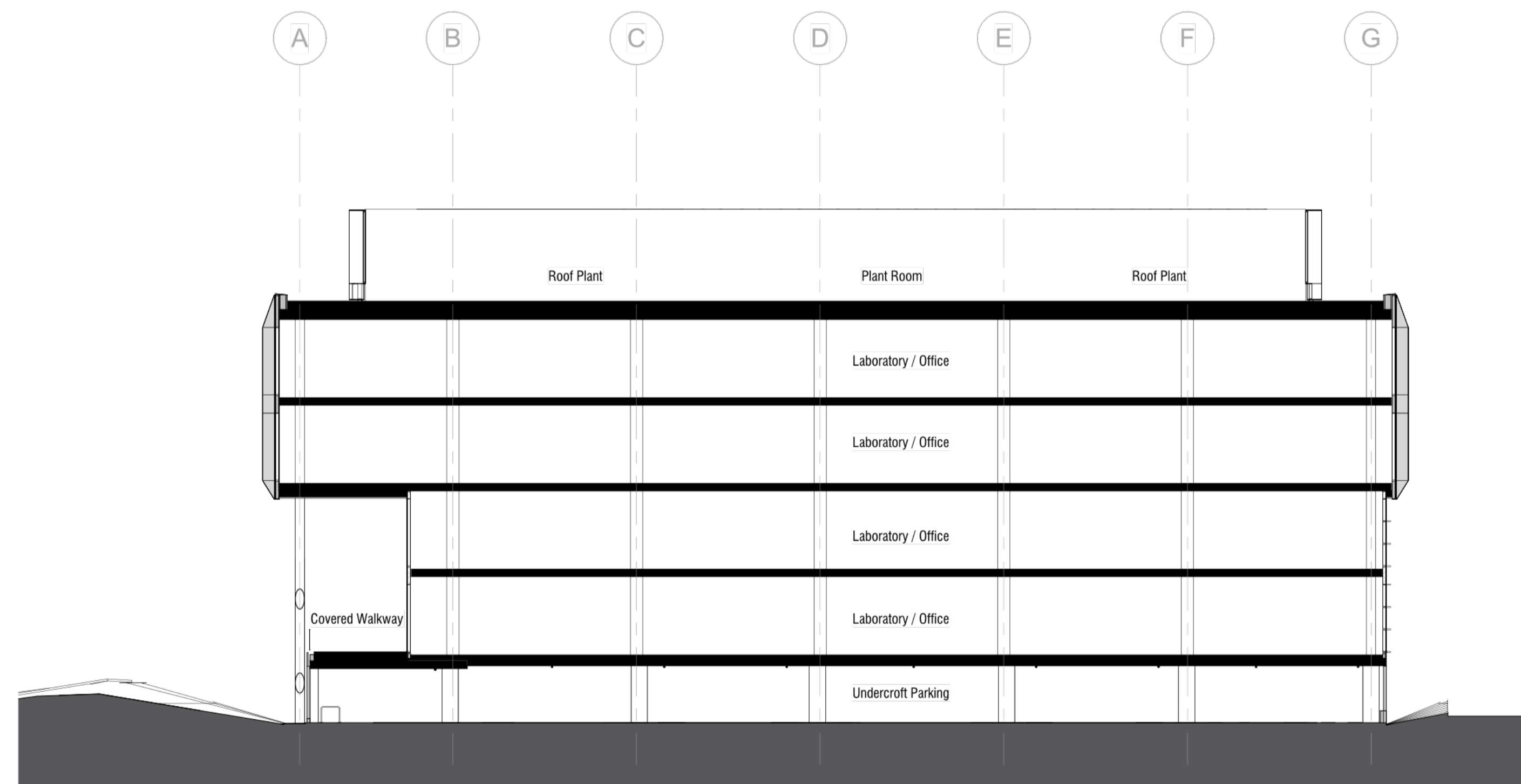
BB PROPOSED BUILDING 2 - GA SECTION BB 1:200