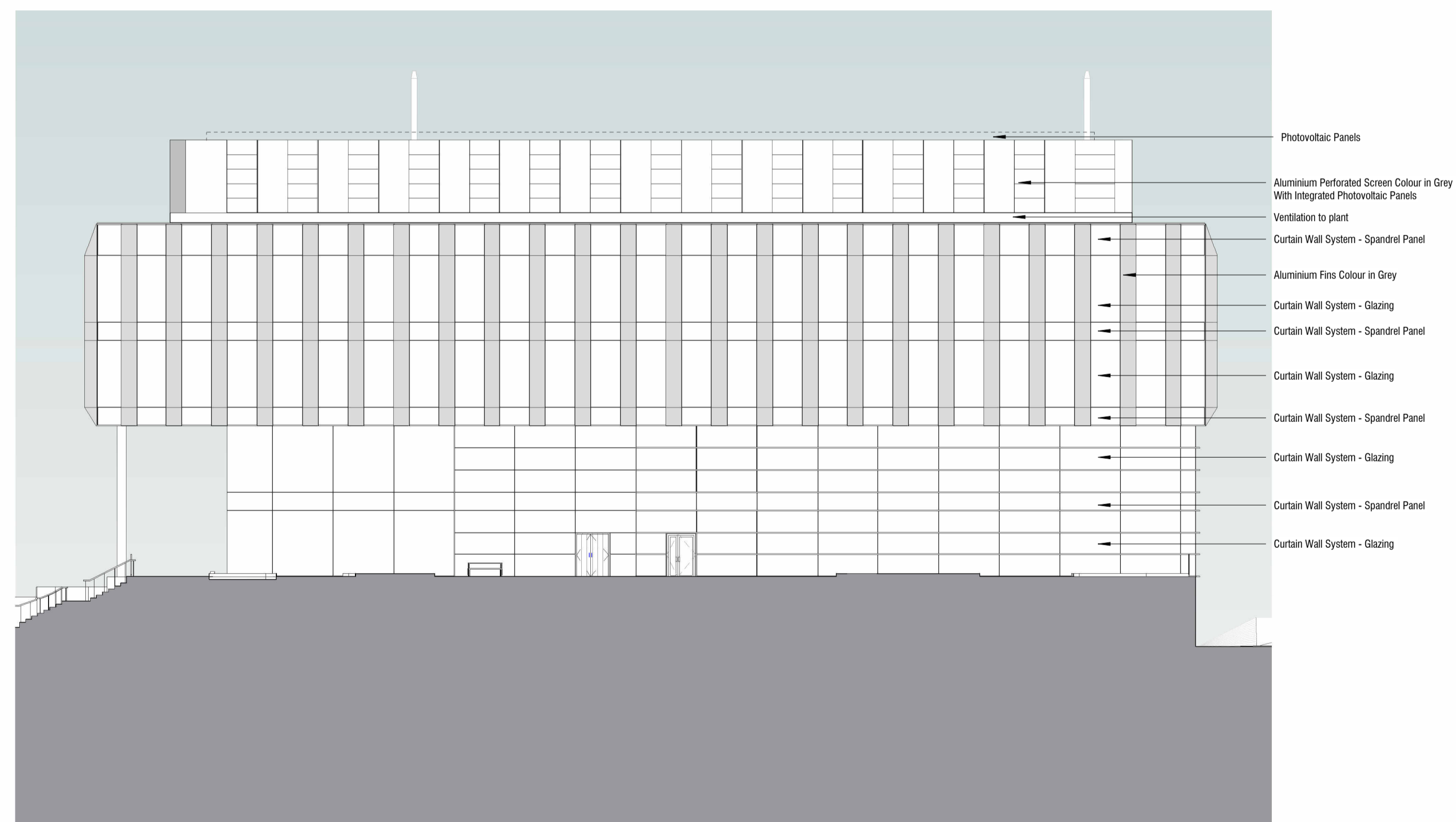
2 PROPOSED BUILDING 2 - NORTH WEST ELEVATION 1:200