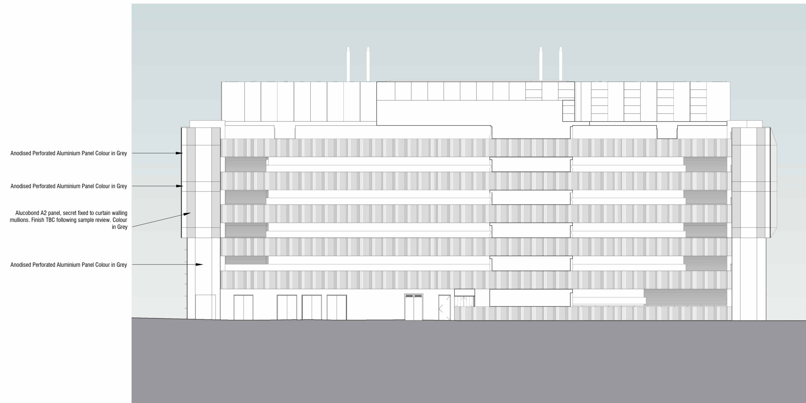
1 PROPOSED BUILDING 3 - SOUTH EAST ELEVATION 1:200