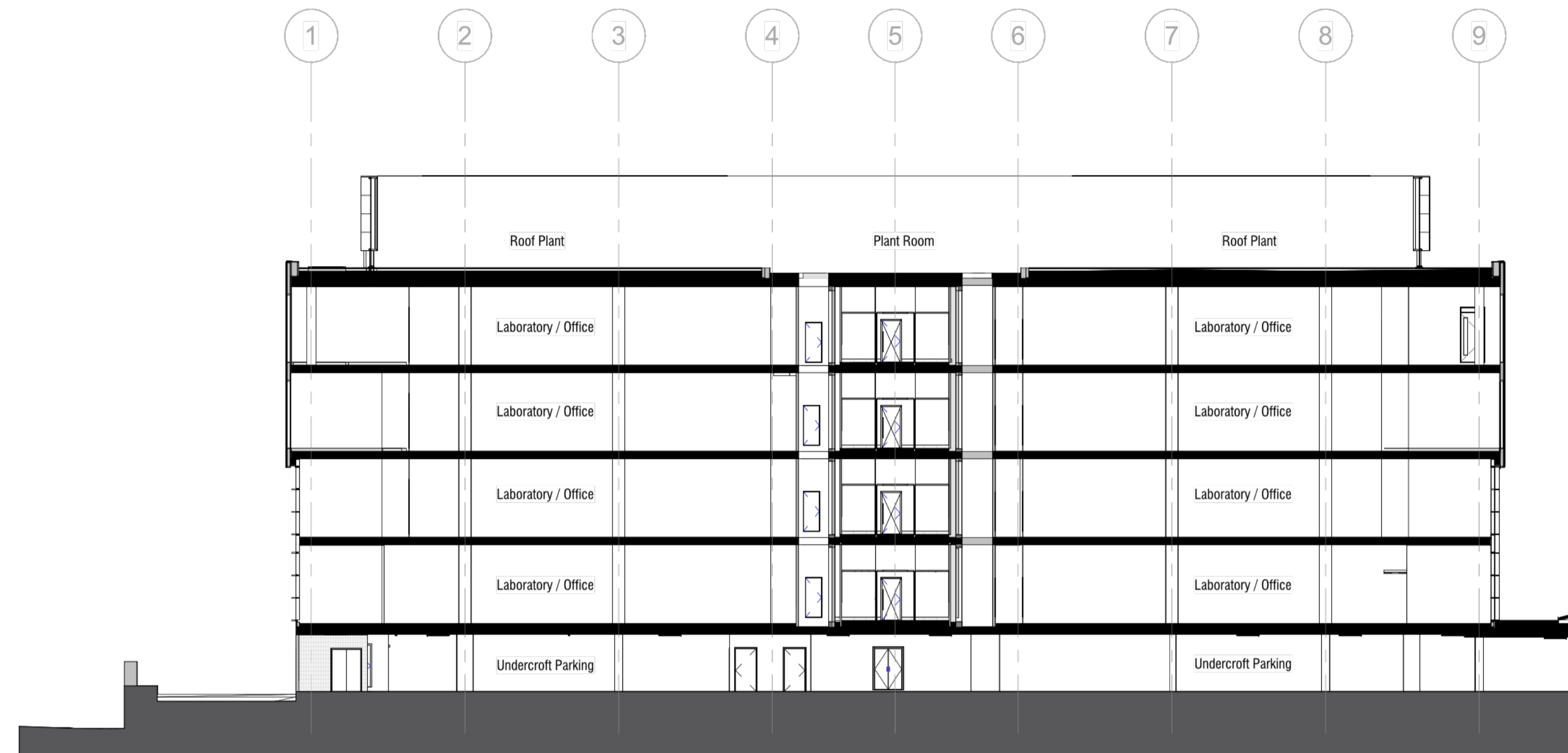
AA PROPOSED BUILDING 1 - GA SECTION AA 1:200