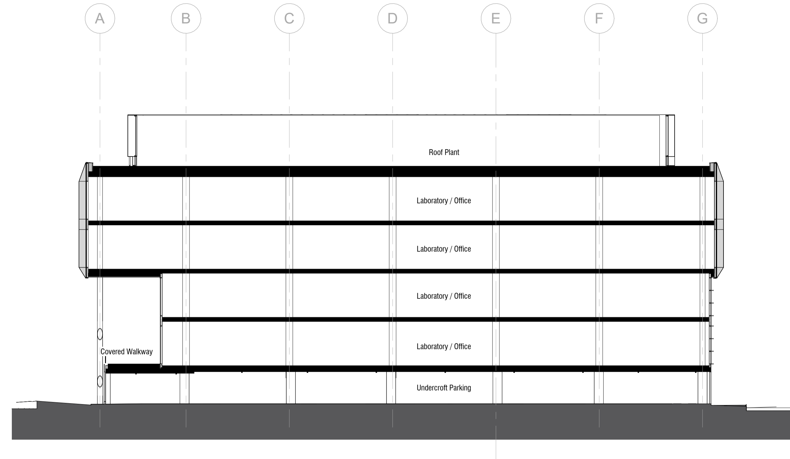
CC PROPOSED BUILDING 1 - GA SECTION CC 1:200