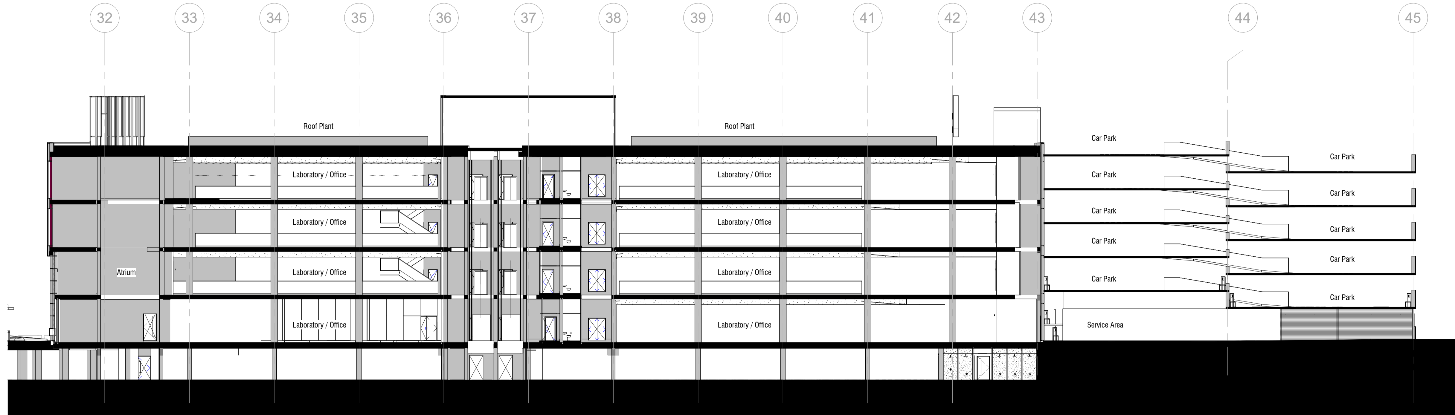
AA PROPOSED BUILDING 3 - GA SECTION AA 1:200