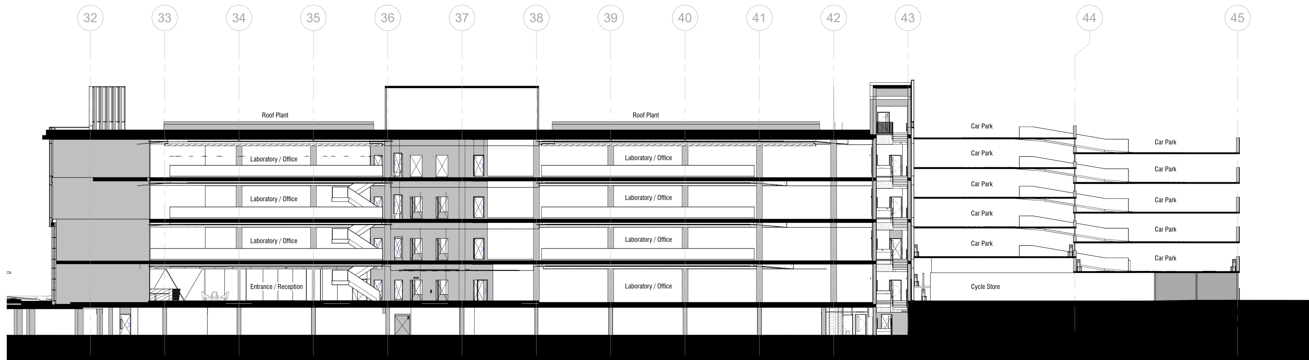
BB PROPOSED BUILDING 3 - GA SECTION BB 1:200