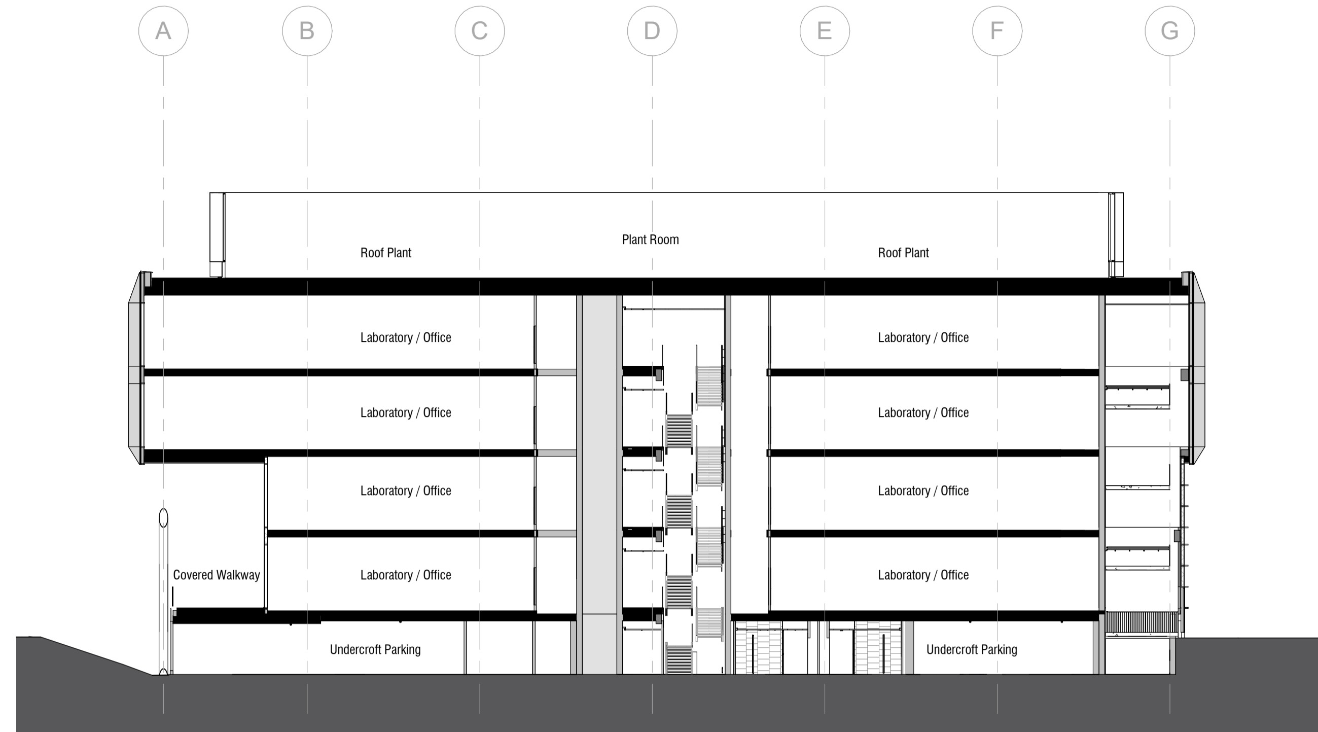
CC PROPOSED BUILDING 2 - GA SECTION CC 1:200