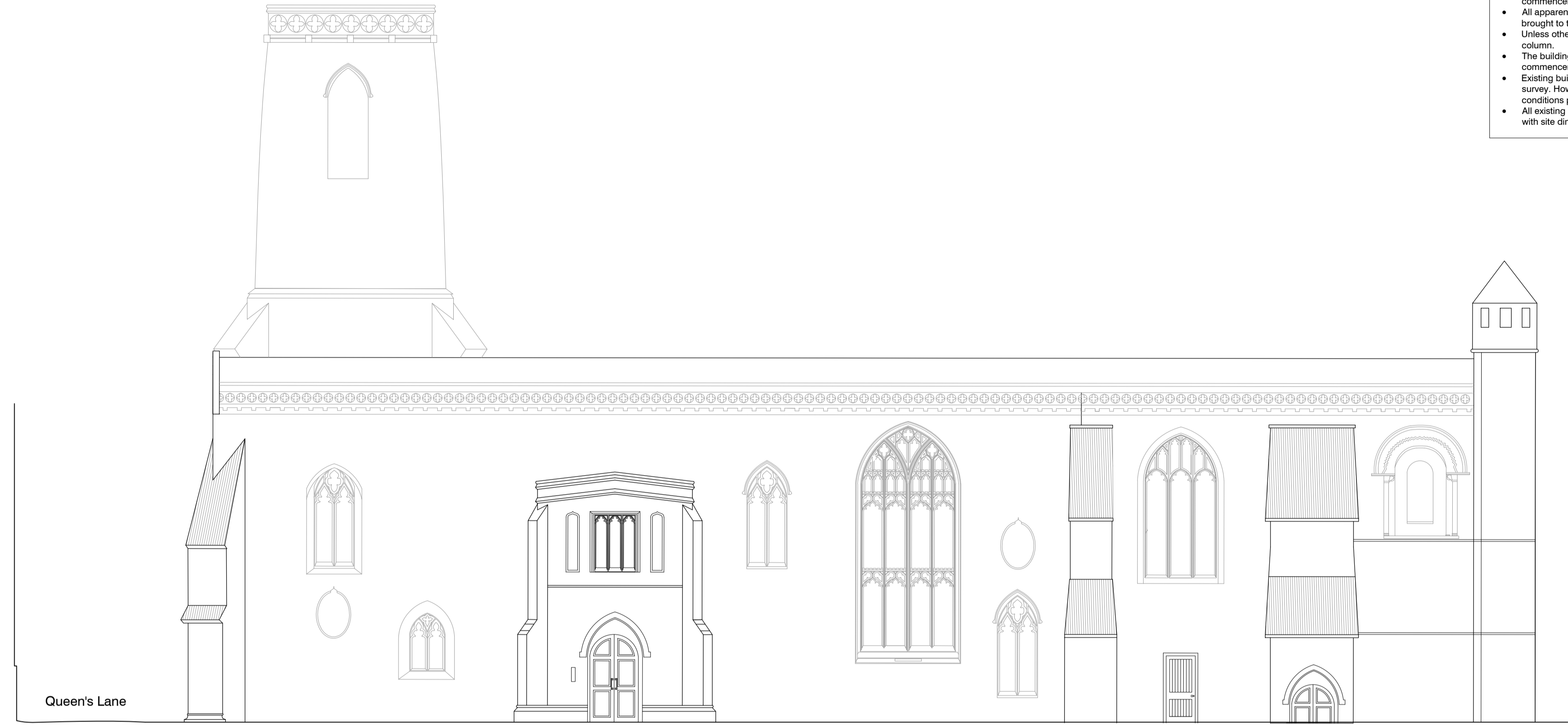
2 SOUTH ELEVATION 1:100