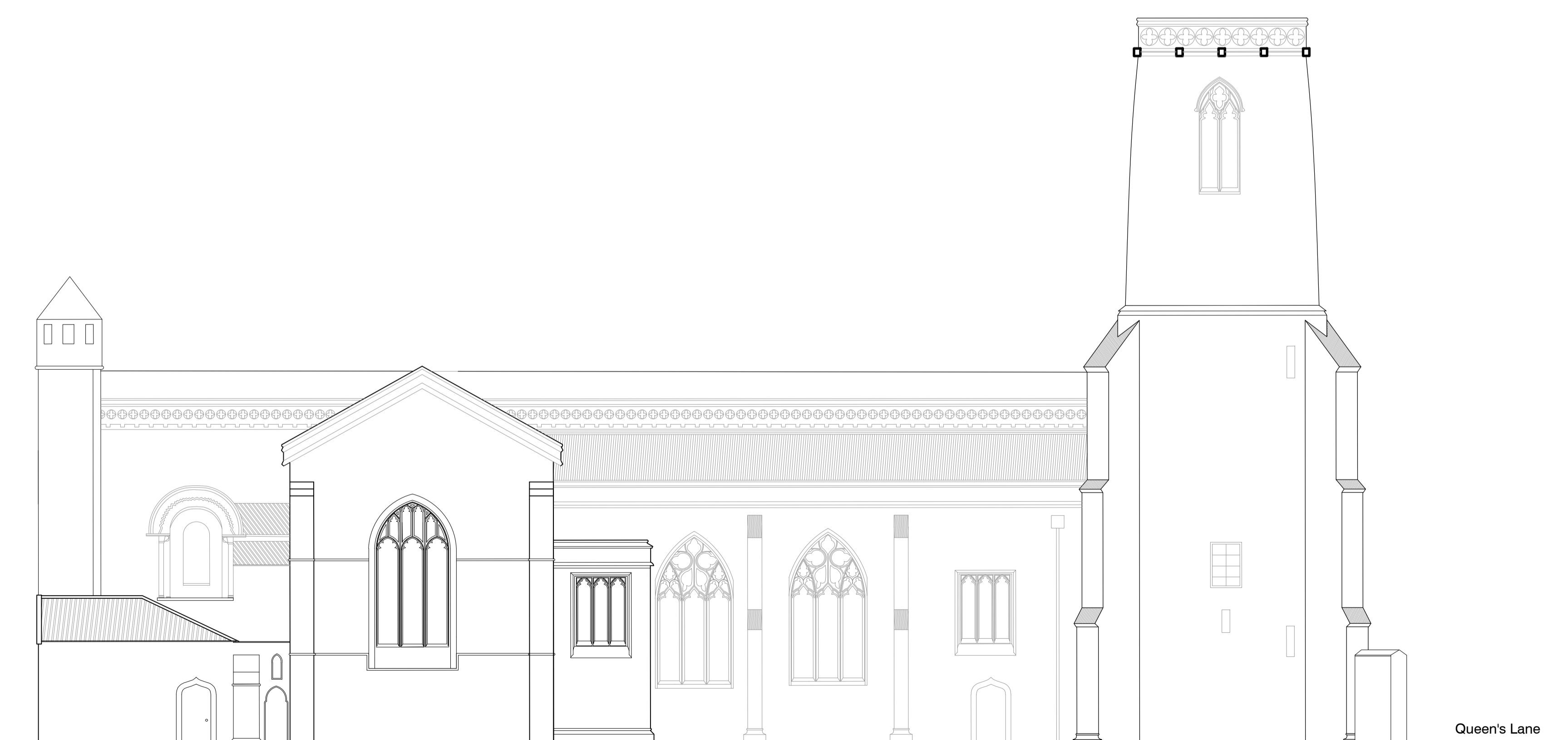
4 NORTH ELEVATION 1:100