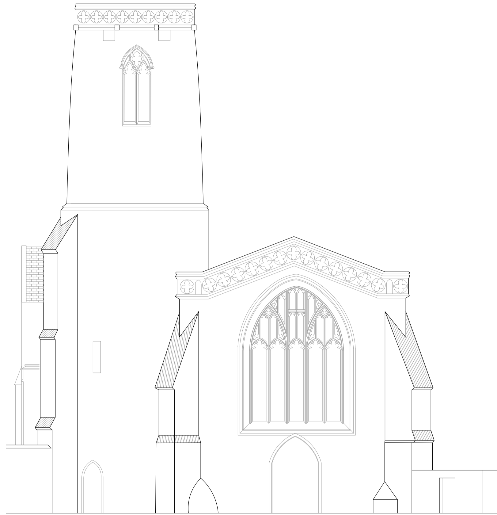
1 WEST ELEVATION 1:100