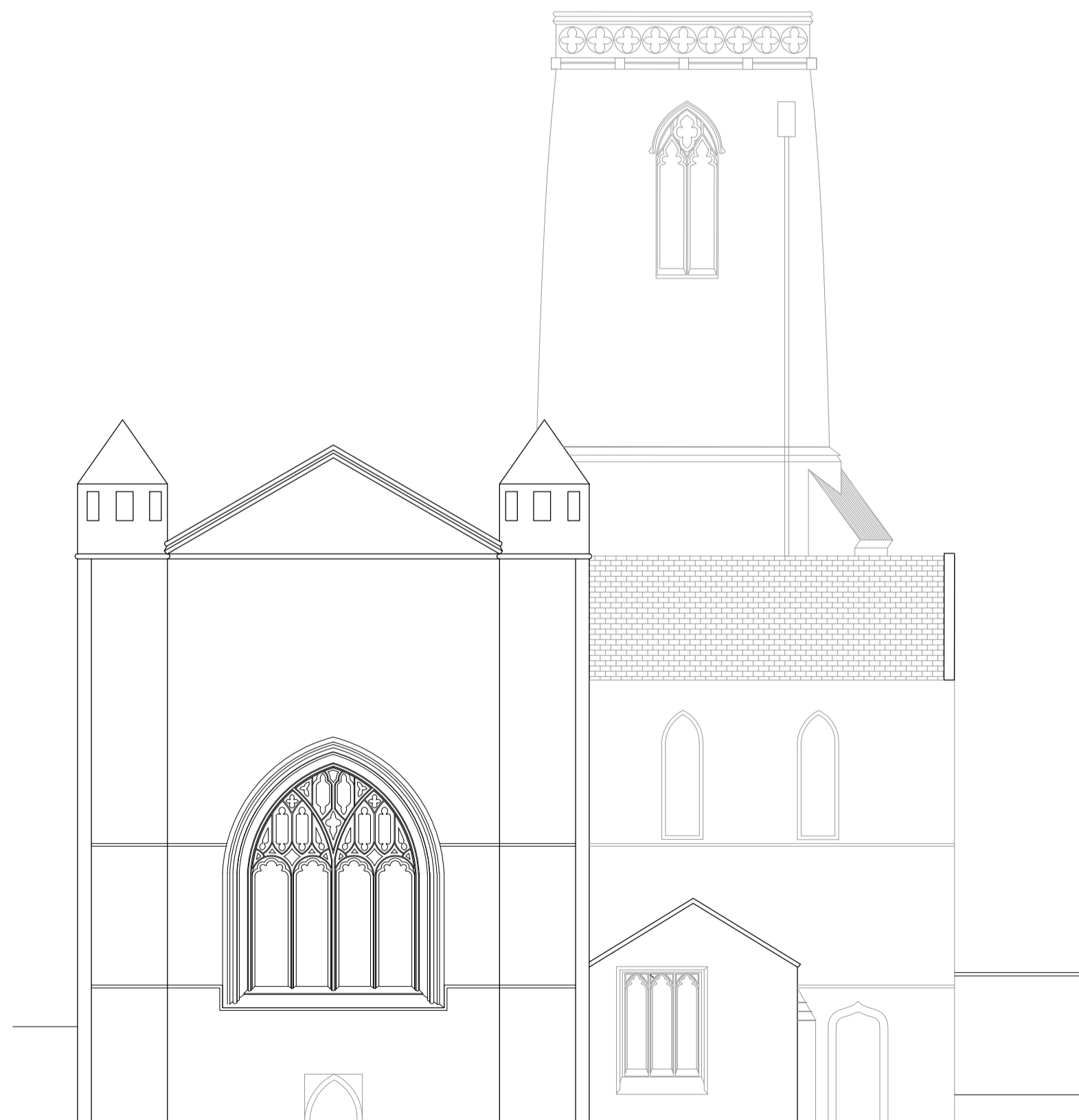
3 EAST ELEVATION 1:100