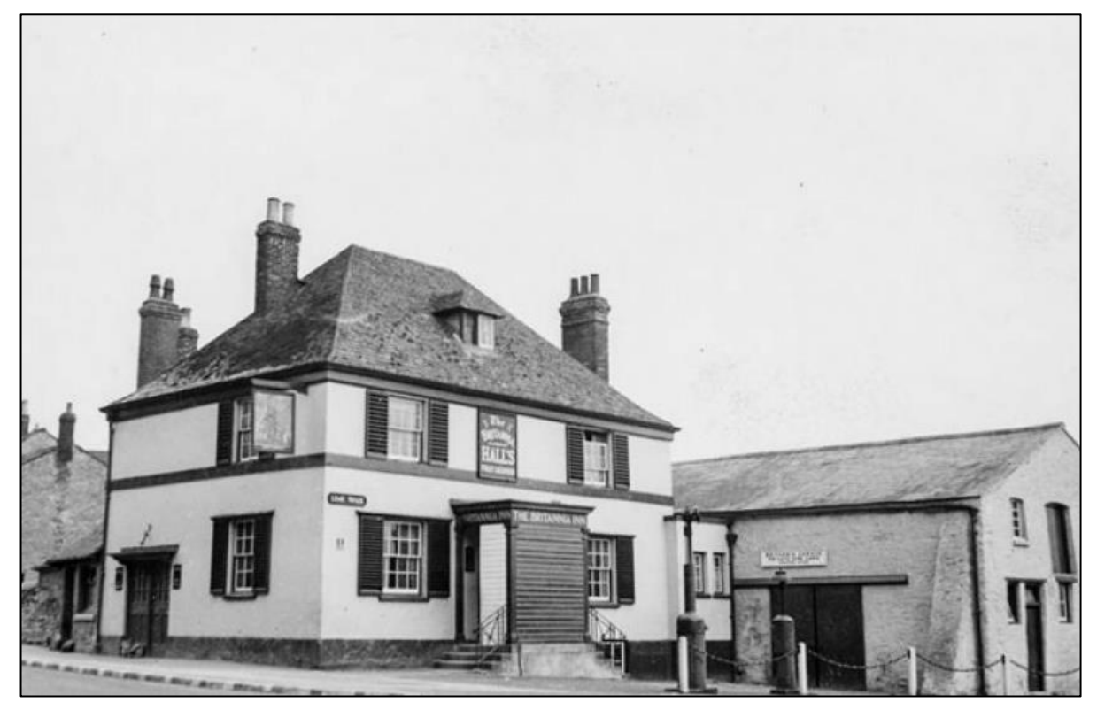
Figure 4: The Britannia Inn Circa 1941