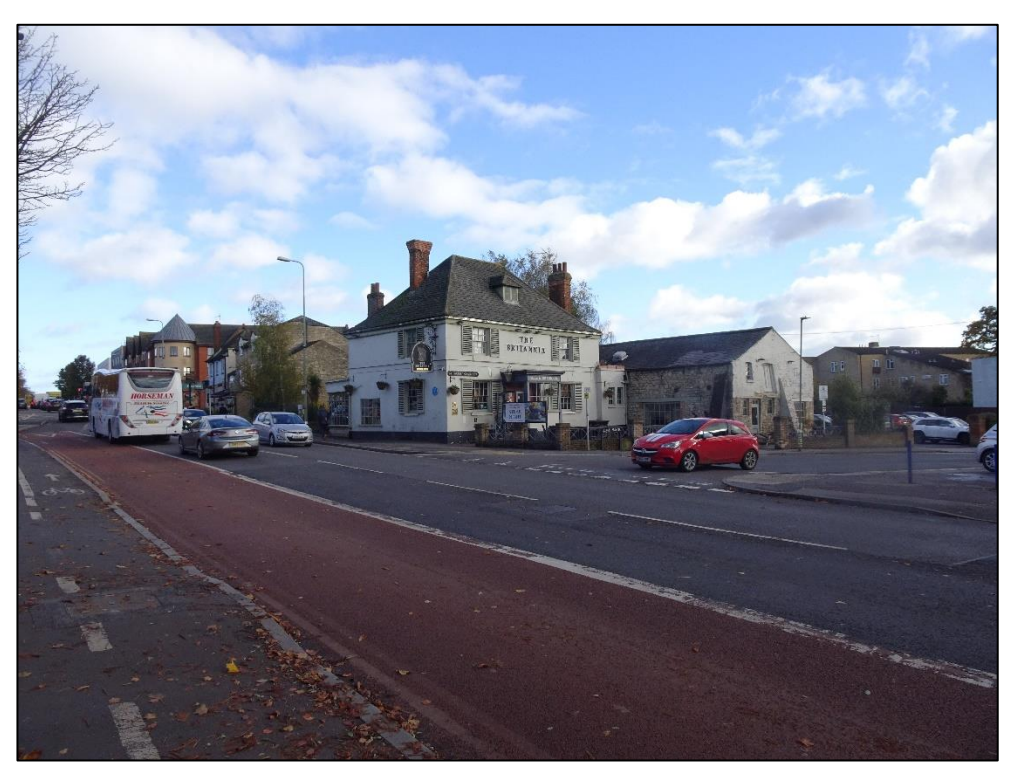
Figure 1: The Britannia Inn