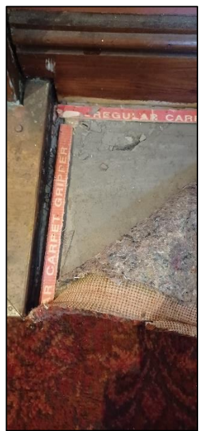
Figure 5: Concrete Floor Under Carpet

repairs to the elevation, the building will be decorated in colours that are in keeping with its age and significance. External lights will be rationalised and the garden refurbished. These works will, again, have a neutral impact upon heritage significance.