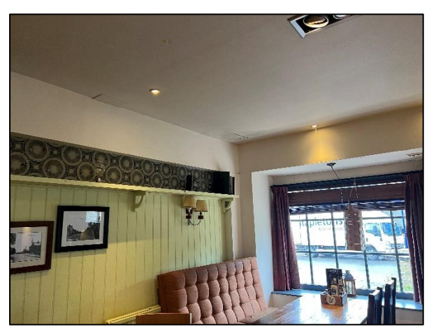
Figure 6: Interior of Stone Barn

The interior of the public house (Photos 11 to 26) is much altered with few original features surviving. The new timber floor, which will be laid upon an existing concrete surface (see Figure 5), is in keeping with the property. The same is true for the new screen (which will enclose a gap in an internal wall) and changes to the back bar fitting and bar counter. Two modern fireplaces will be refurbished, in a manner sympathetic to the character of the building, with part of the modern panelling being removed from a dining room wall in the converted barn (Figure 6) and timber cladding added to the entrance from the car park.