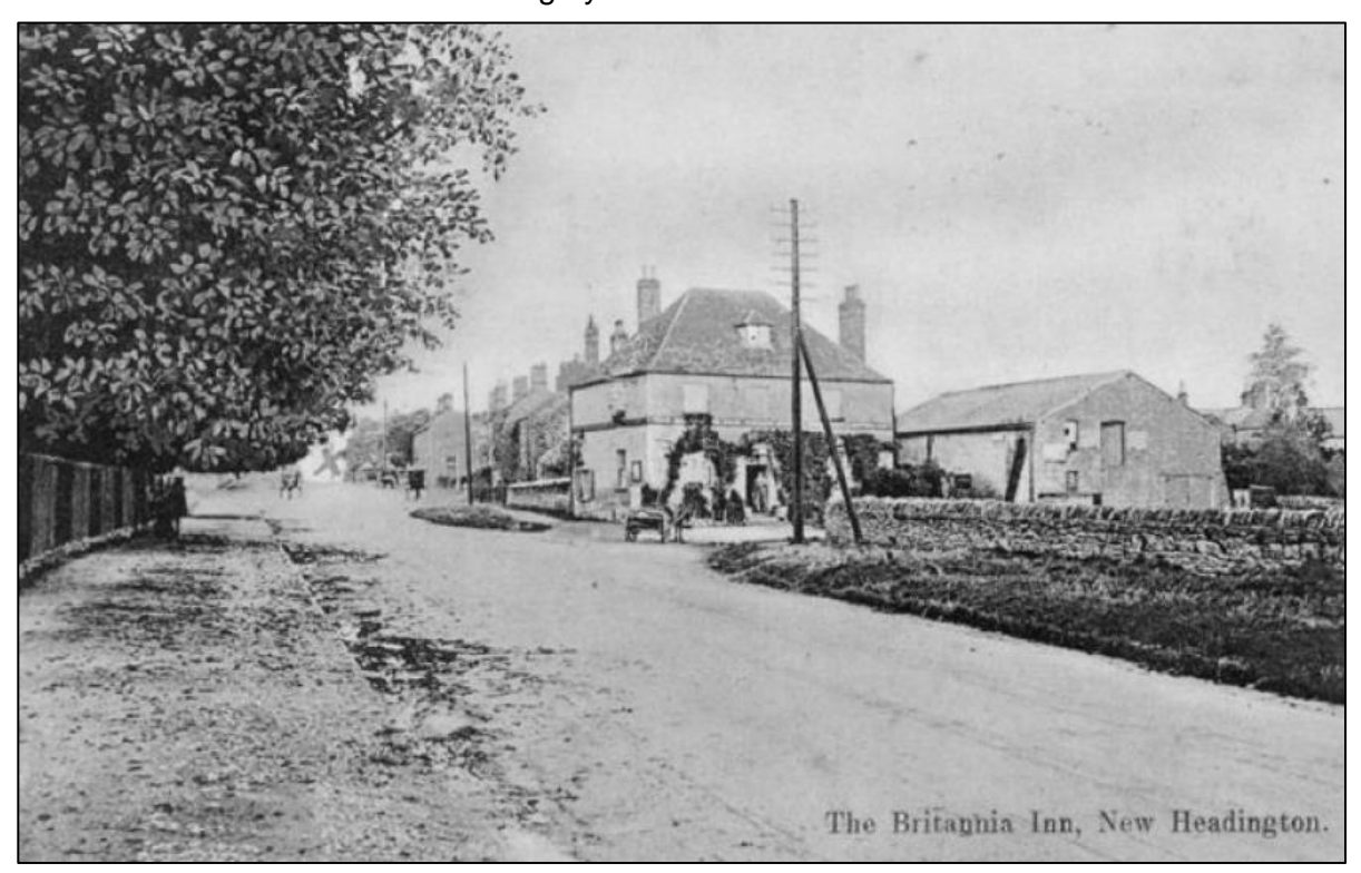
Figure 3: The Britannia Inn Circa 1915

Figures 3 and 4 are images of the property dating from 1915 and 1941, respectively. A buttress can be seen in both images, confirming that the stone barn has been moving for many years. The barn appears as a separate building in the 1915 image, but appears to have been linked to the main building by 1941.