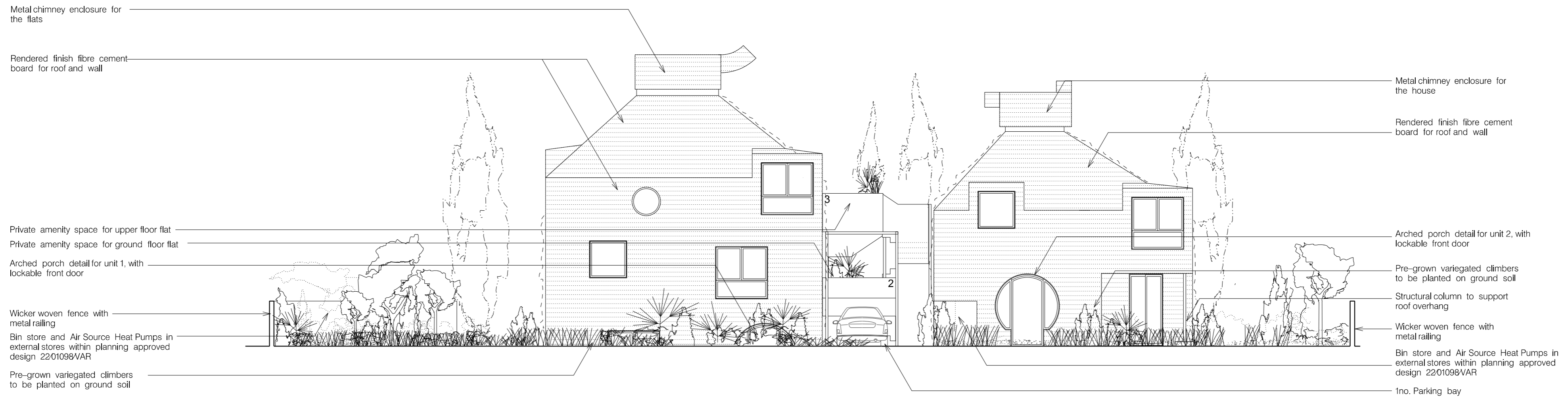
① PROPOSED SOUTH ELEVATION