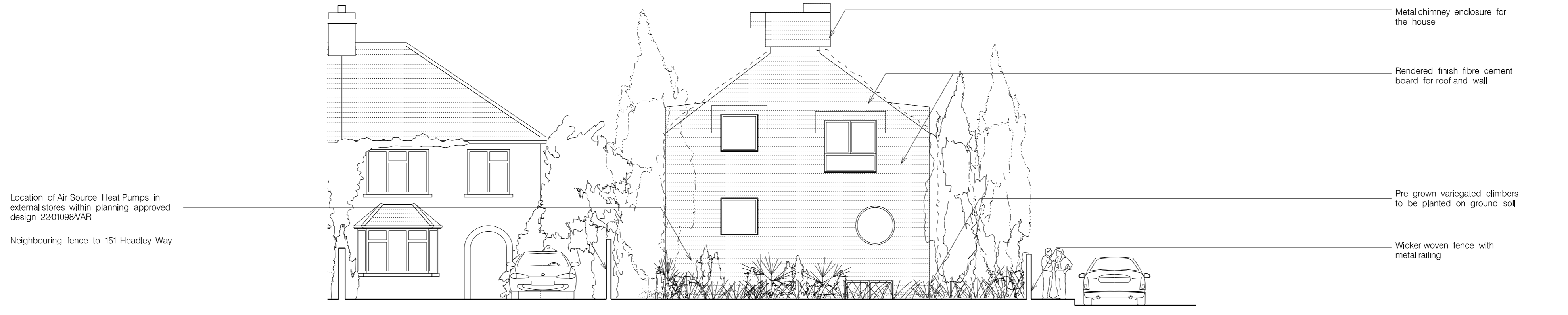
③ PROPOSED WEST ELEVATION