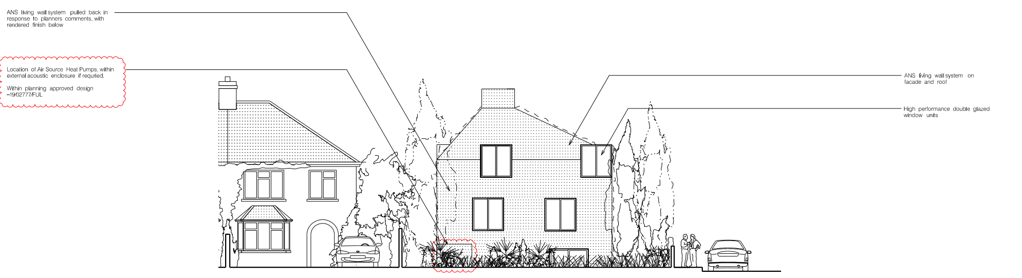
③ PROPOSED WEST ELEVATION