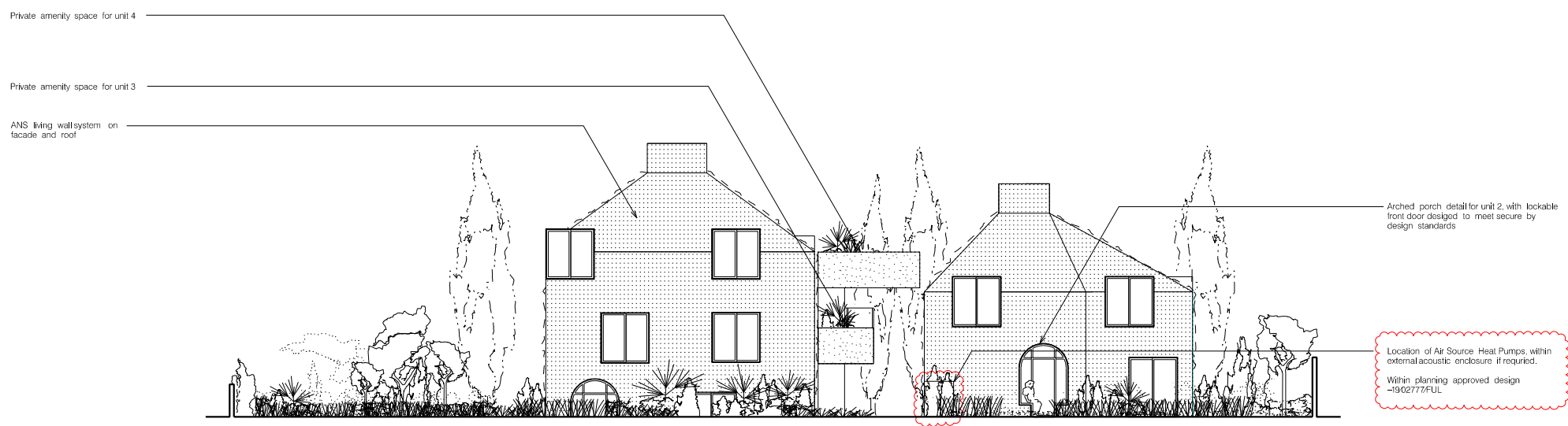
① PROPOSED SOUTH ELEVATION