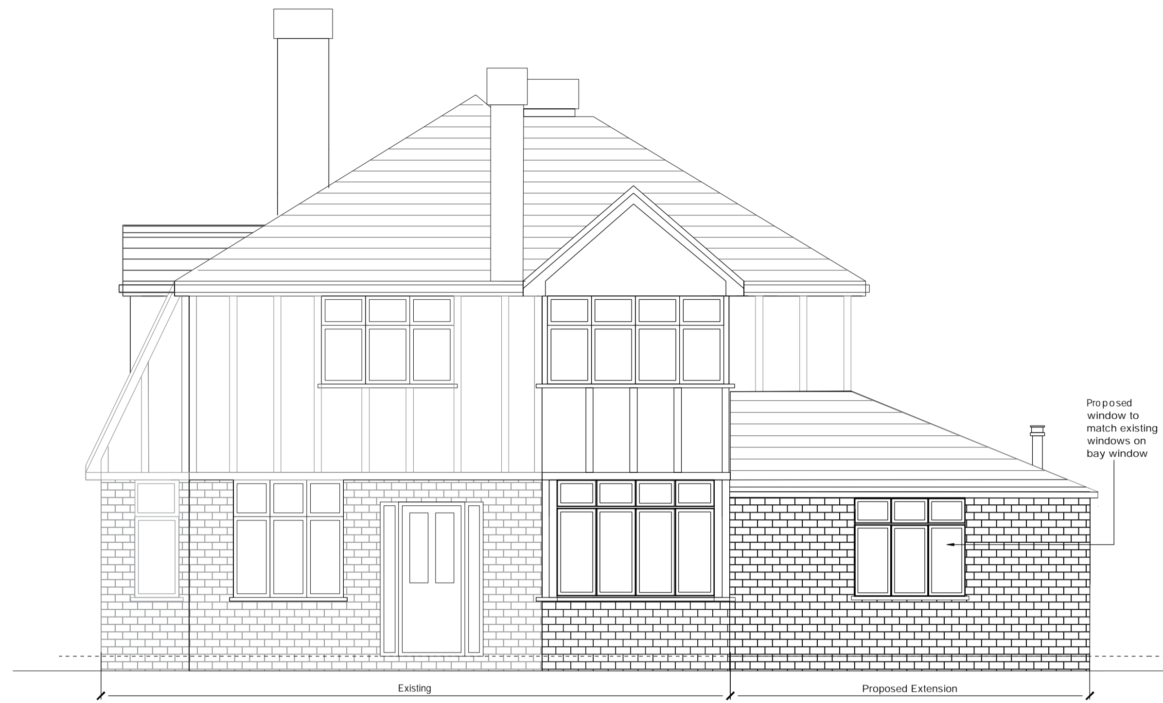
RIGHT (EAST) ELEVATION