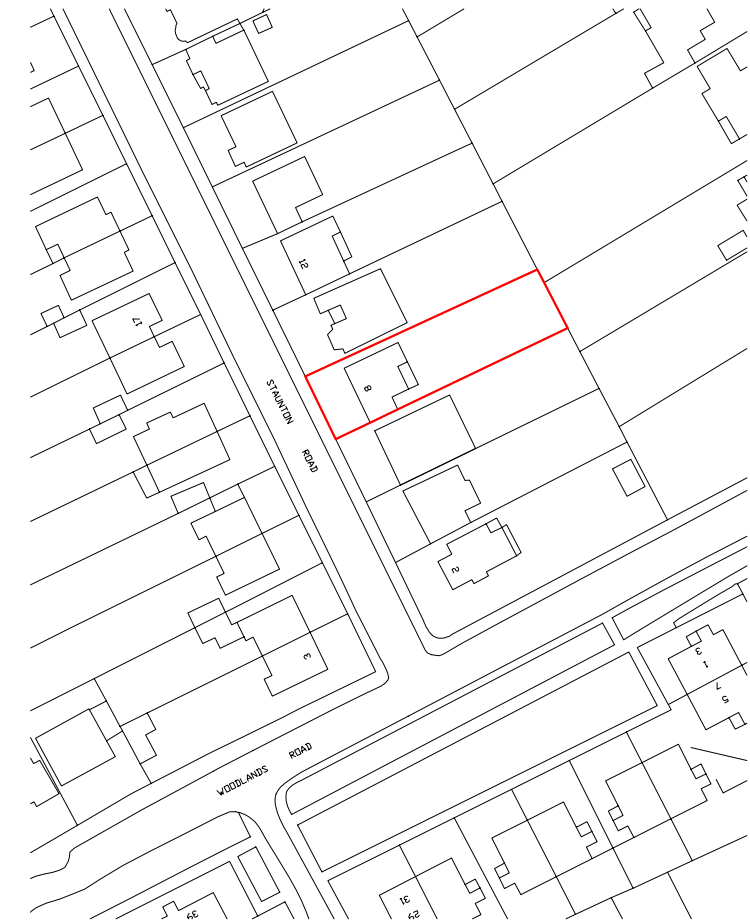
LAYOUT PLAN - 1:1250