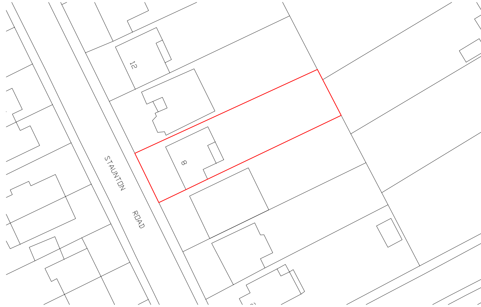
SITE PLAN - 1:500