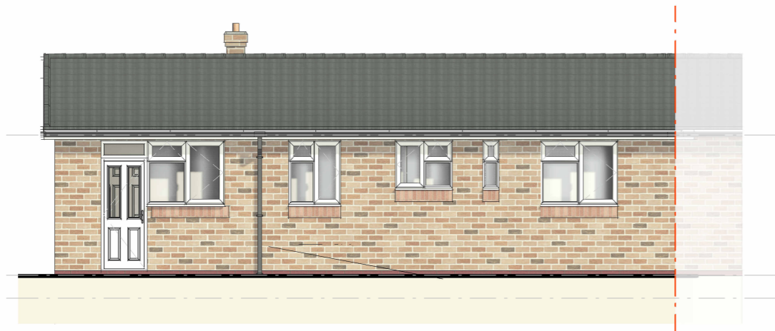
RE EX. REAR ELEVATION SCALE 1 : 100