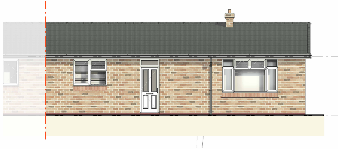
FE EX. FRONT ELEVATION SCALE 1 : 100