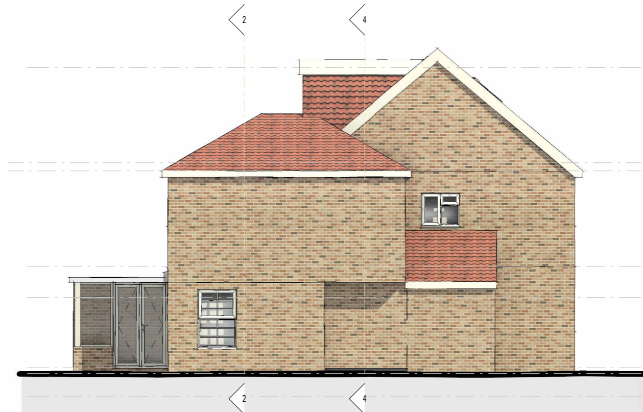
RS PRO. RIGHTSIDE ELEVATION SCALE 1 : 100