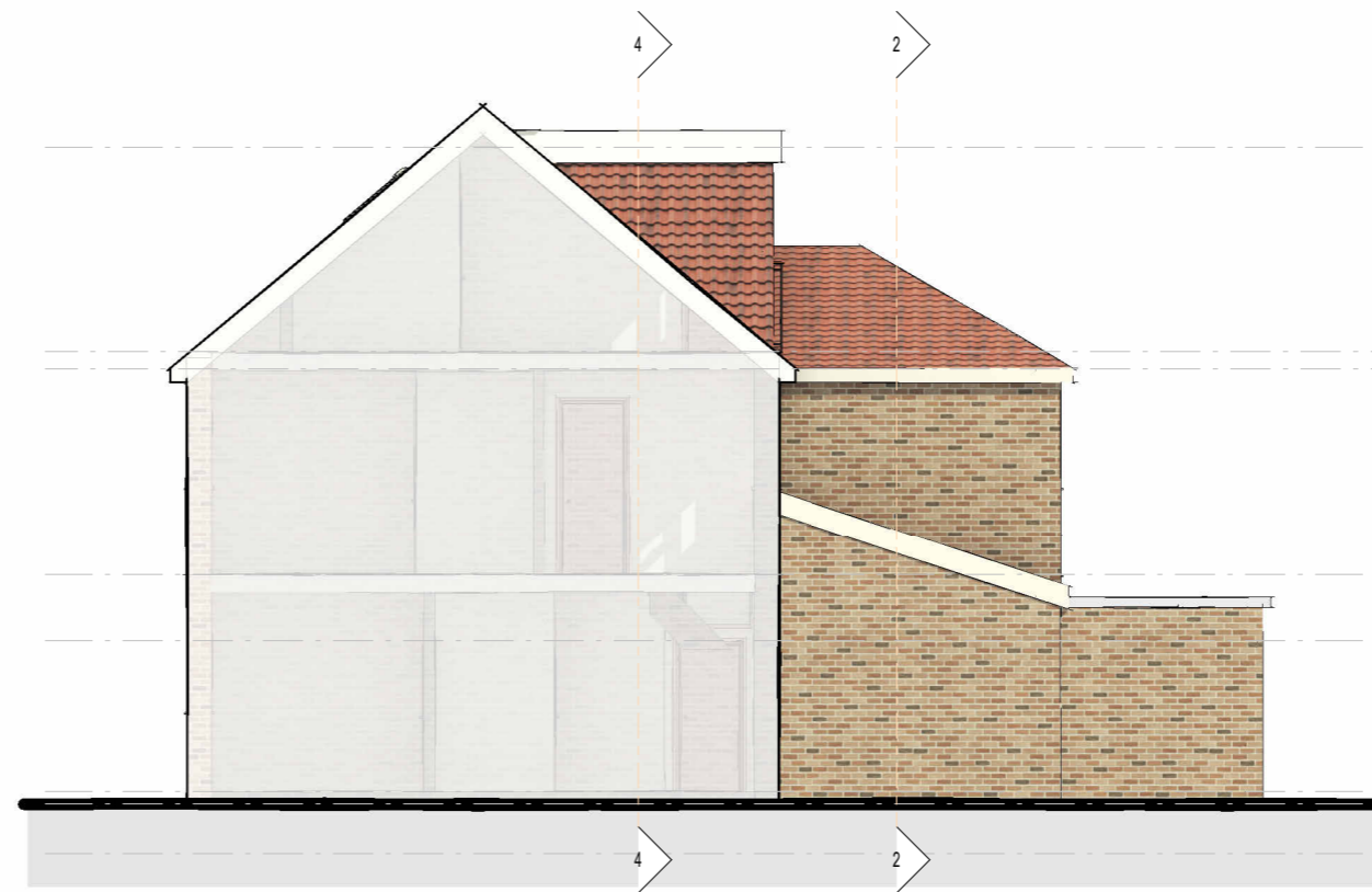
LS PRO. LEFTSIDE ELEVATION SCALE 1 : 100