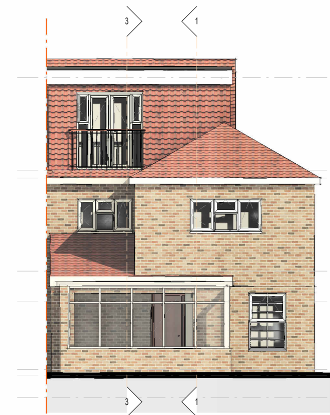
RE PRO. REAR ELEVATION SCALE 1 : 100