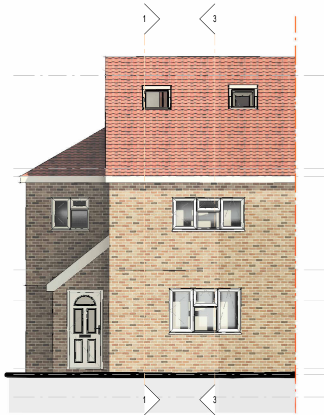
FE PRO. FRONT ELEVATION SCALE 1 : 100