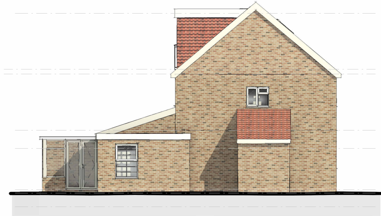
RS EX. RIGHTSIDE ELEVATION SCALE 1 : 100