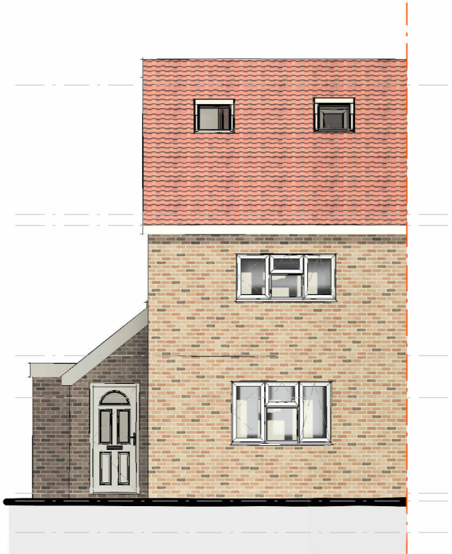
FE EX. FRONT ELEVATION SCALE 1 : 100