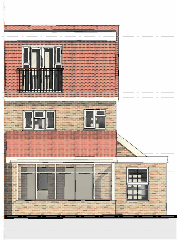
RE EX. REAR ELEVATION SCALE 1 : 100