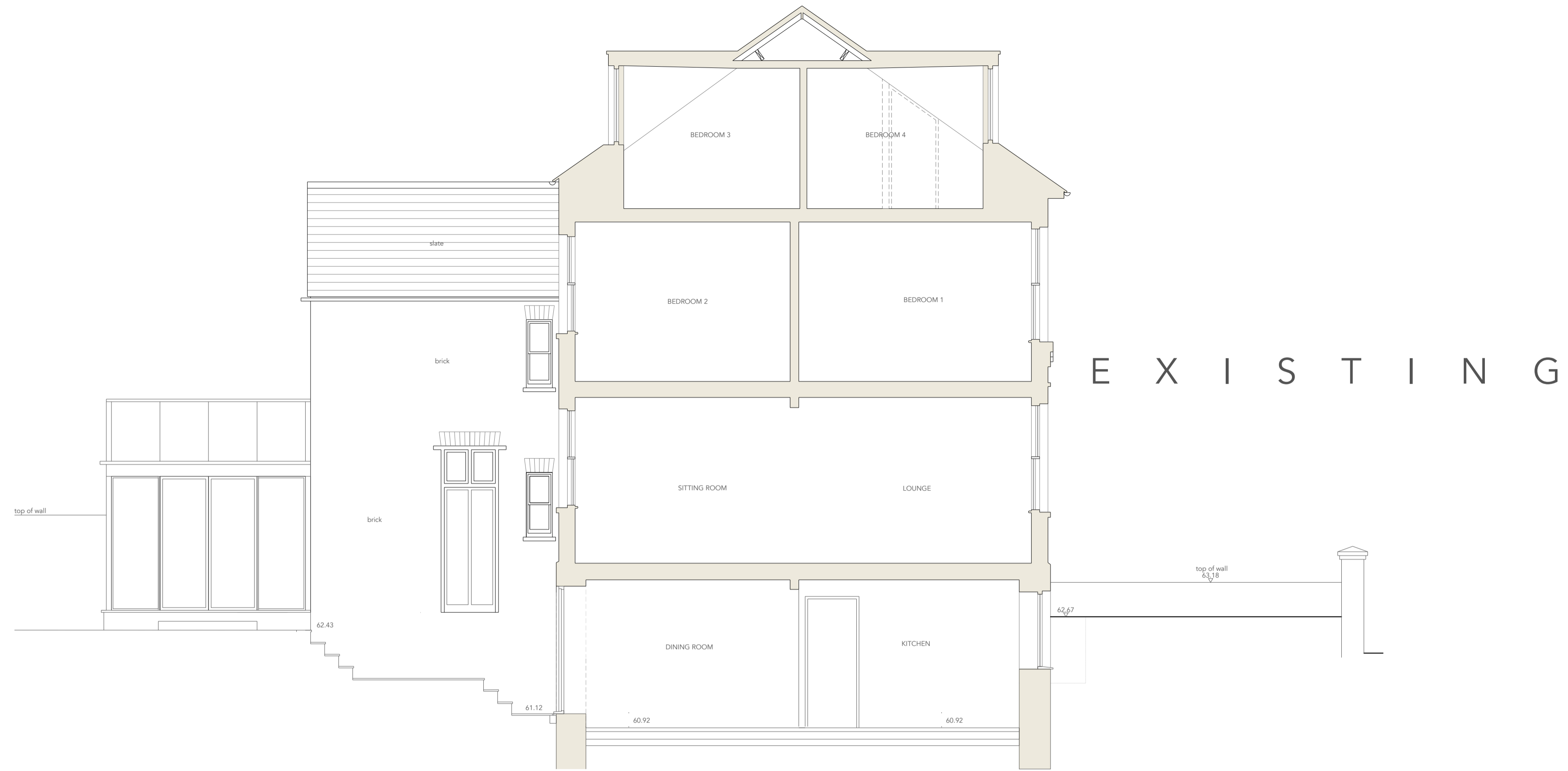
NORTH-WEST ELEVATION 1:50