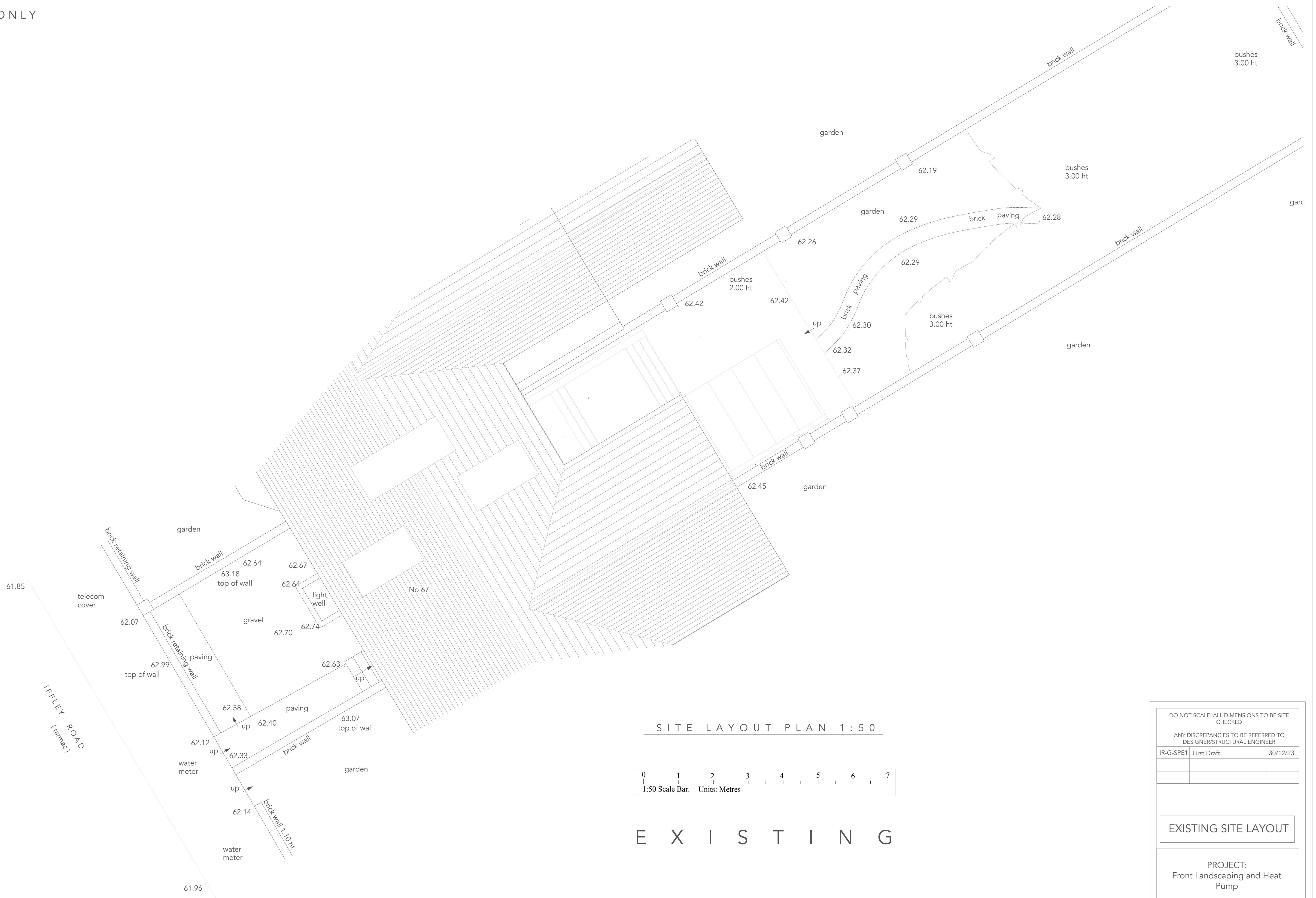
SITE LAYOUT PLAN 1 : 5 0