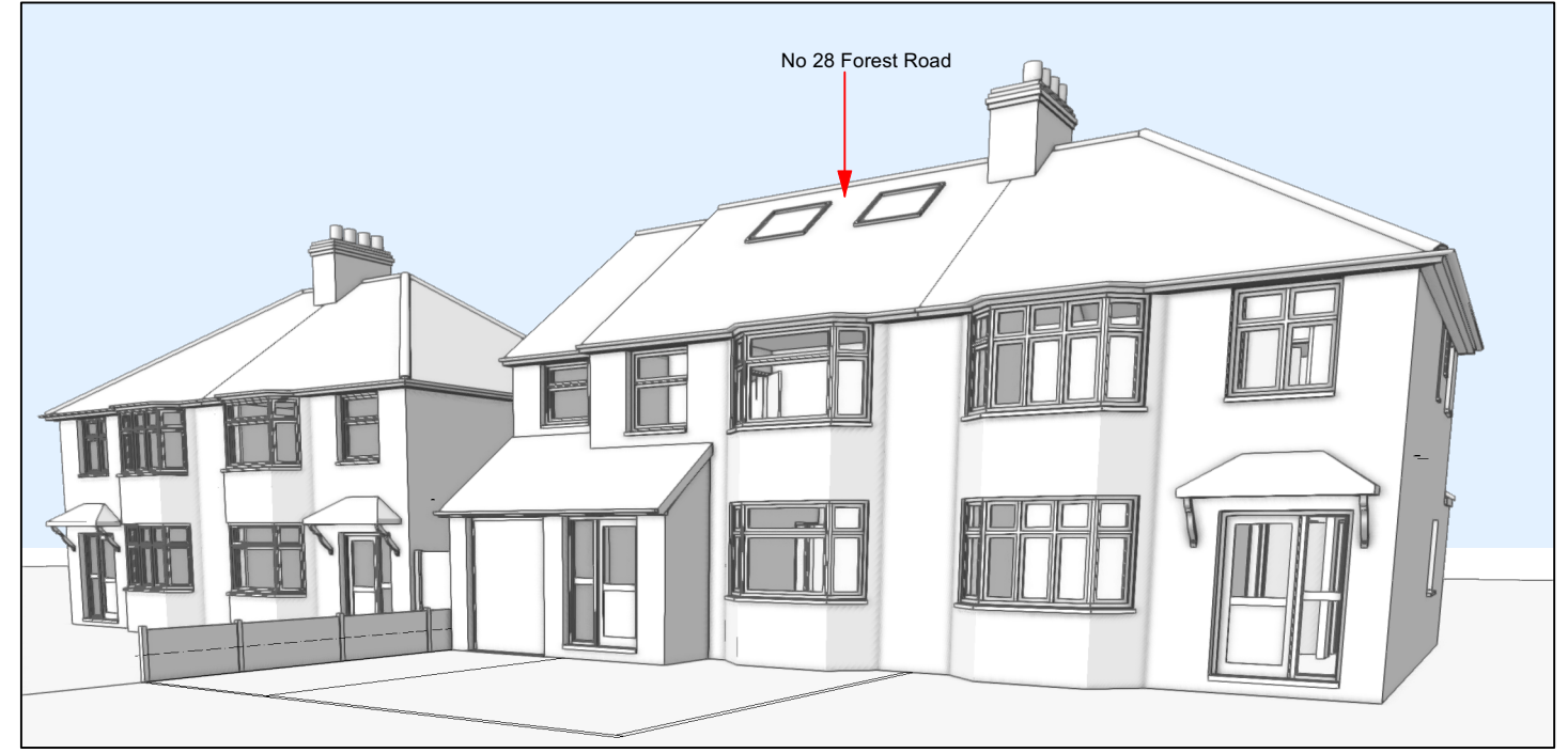
PERSPECTIVE STREET VIEW - Approaching from the west