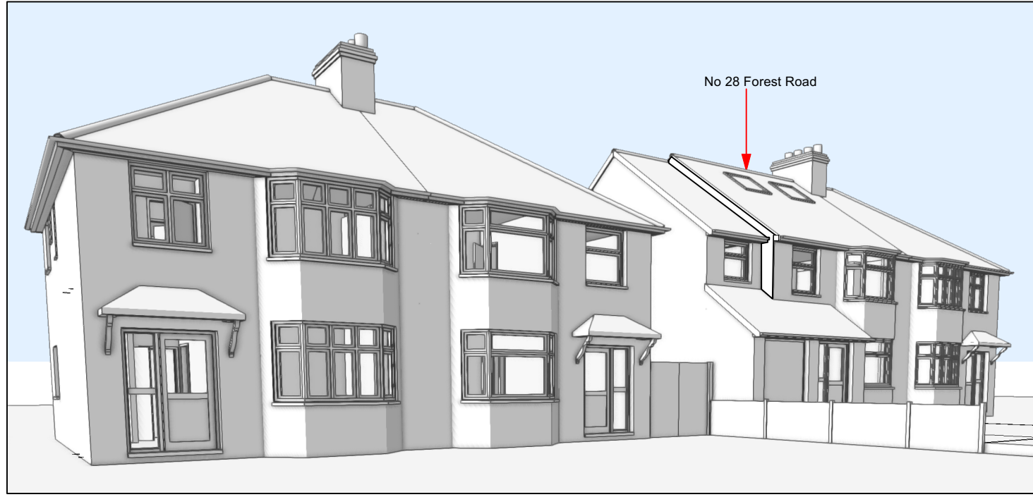
PERSPECTIVE STREET VIEW - Approaching from the east