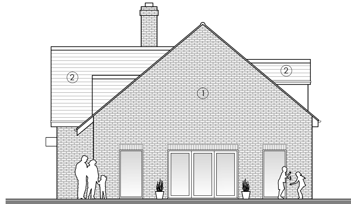
RIGHT FLANK ELEVATION