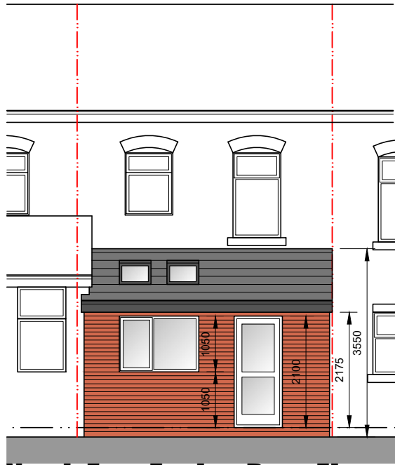
North East Facing Rear Elevation

Conway Architectural Design shall have no responsibility for any use made of this document other than for that which it was prepared and issued. This drawing should not be scaled. Work to figured dimensions only. All dimensions and levels to be checked on site. No building work is to be started until all relevant approvals are in place. Any discrepancies should be reported to Conway Architectural Design. This drawing should not be reproduced without written permission from Conway Architectural Design. Standard Building Regs Notes are to be provided by Conway Architectural Design prior to a building regs application being submitted.