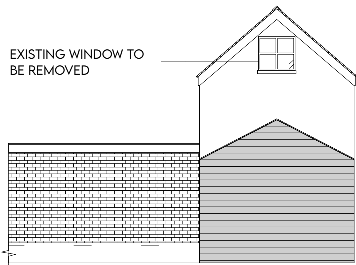
11 Elevation C Scale: 1:100