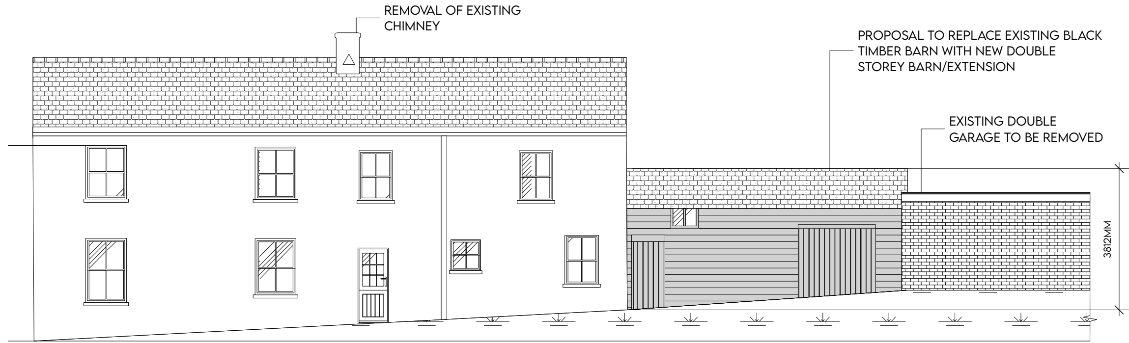
10 Elevation B Scale: 1:100