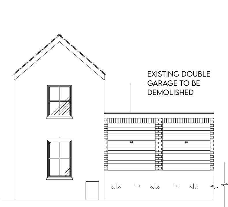
9 Elevation A Scale: 1:100