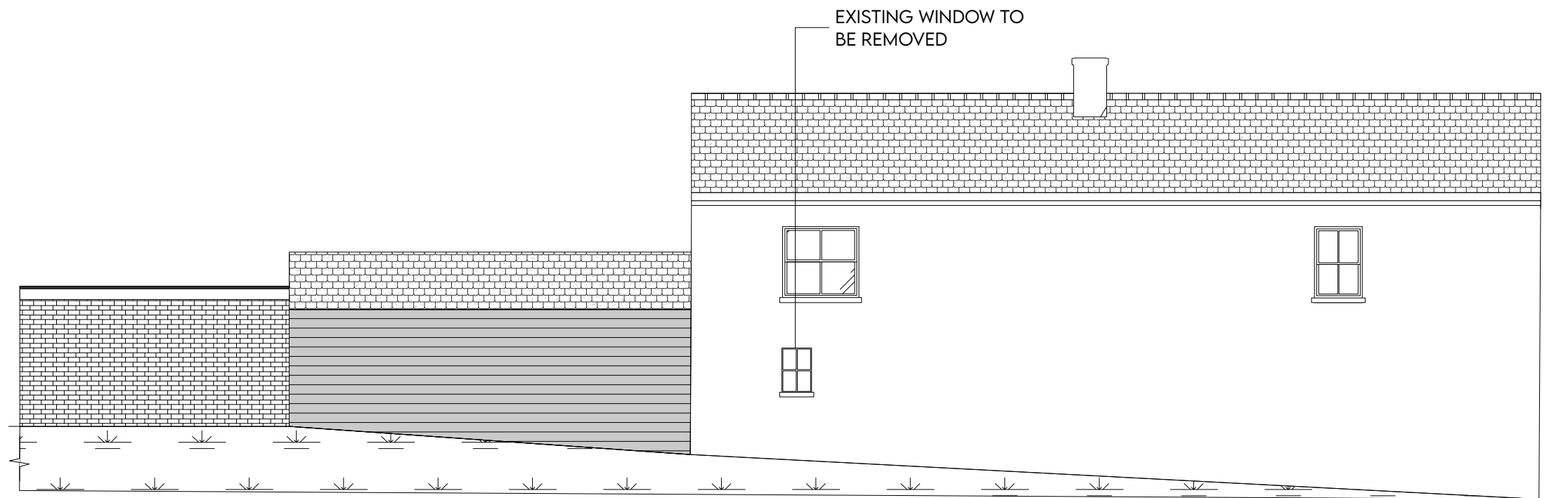
12 Elevation D Scale: 1:100