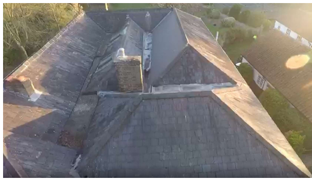
General roof arrangement