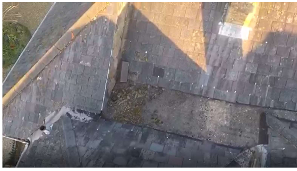
Flat area for services.