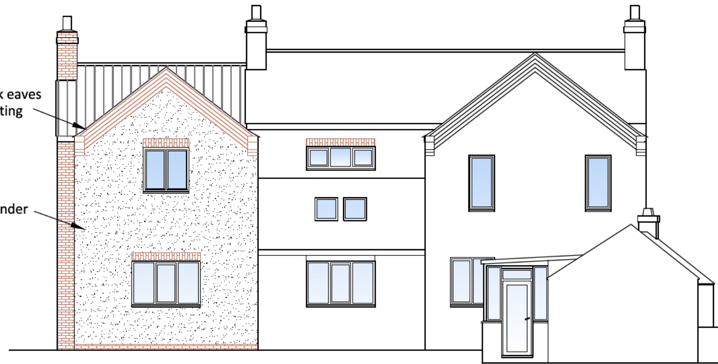
Proposed North East Elevation