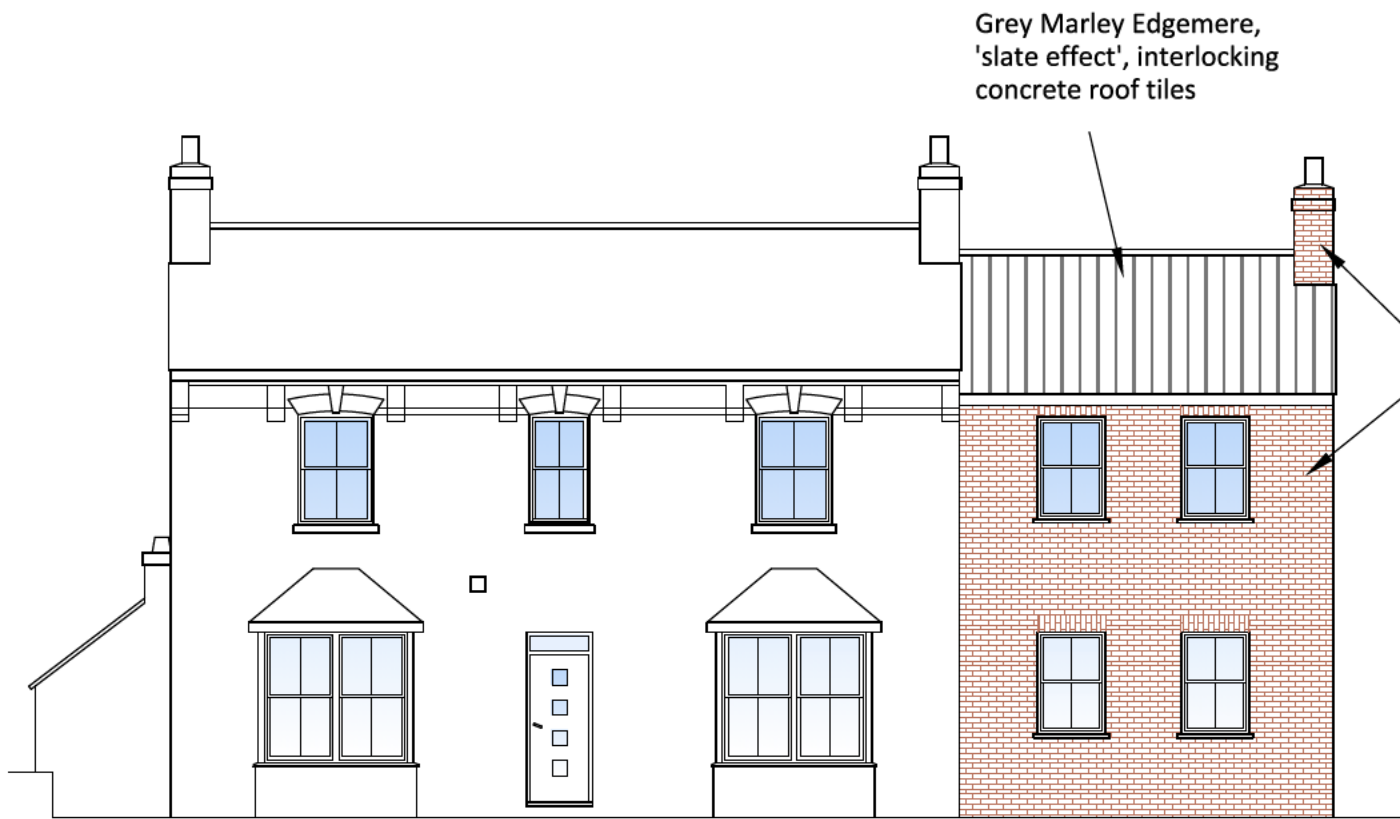
Proposed South West Elevation