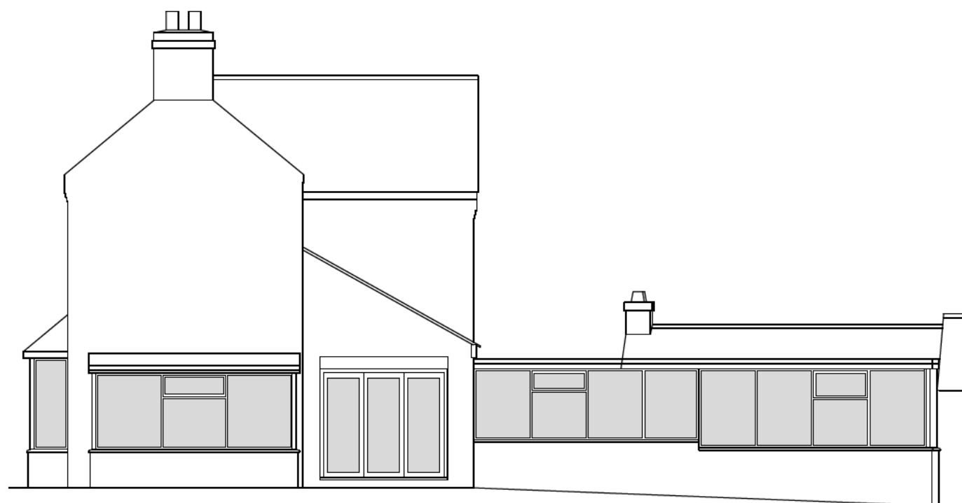
Existing South East Elevation