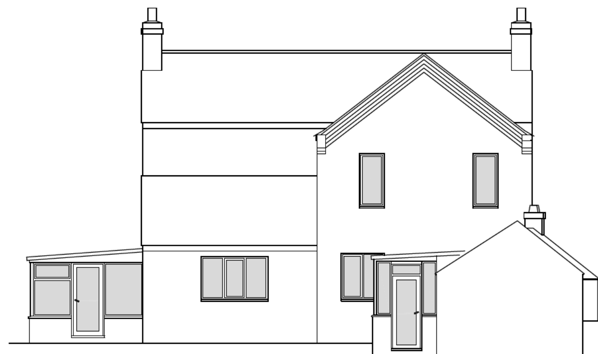
Existing North East Elevation