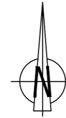
EXISTING SITE LAYOUT