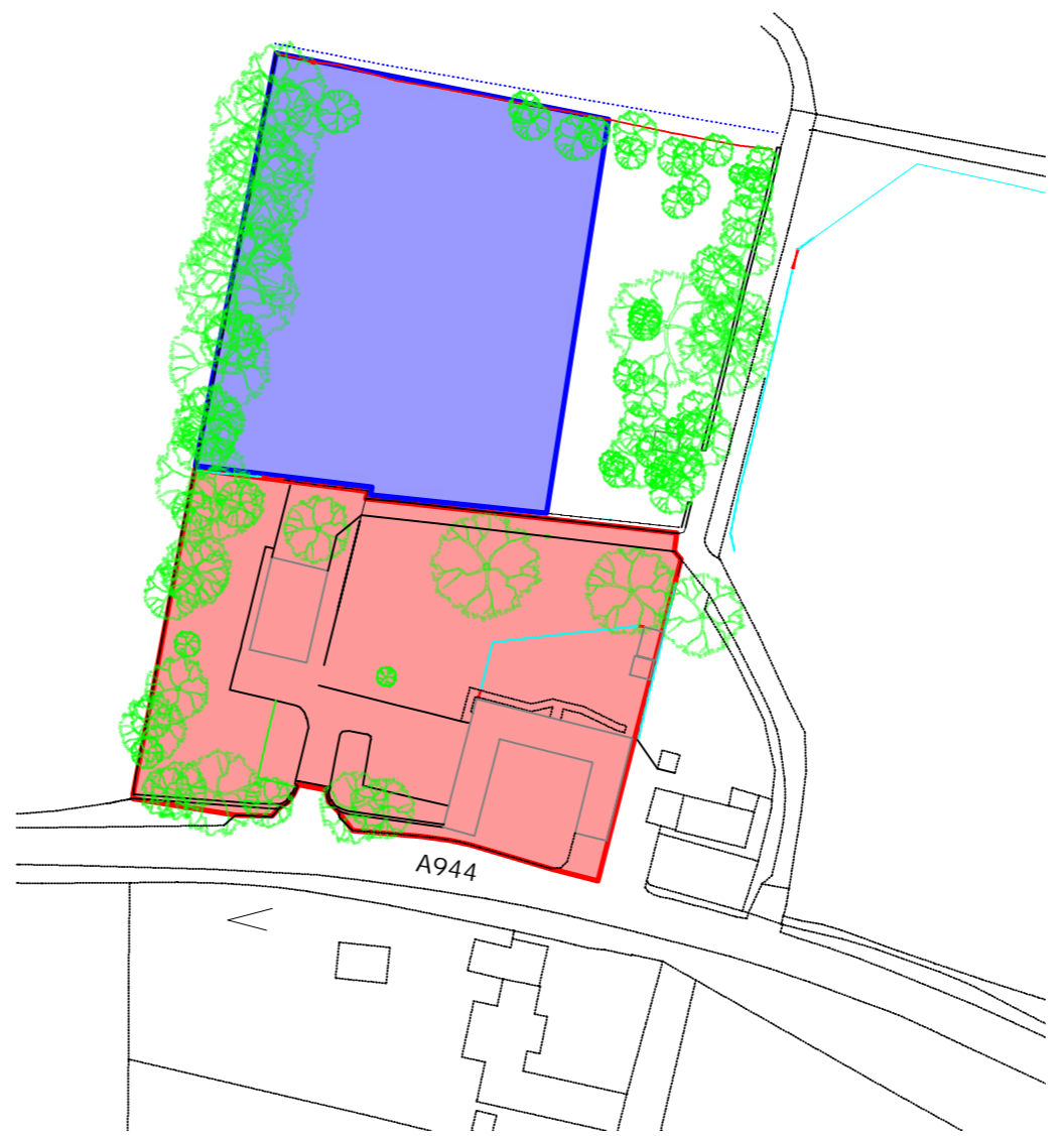
Location Plan 1:1250 SCALE 1:1250