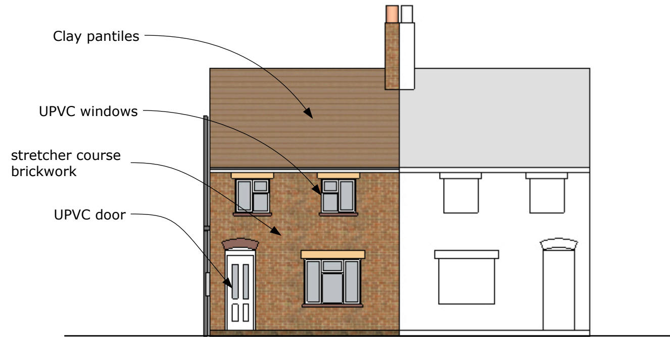
03 110 EXISTING EAST ELEVATION