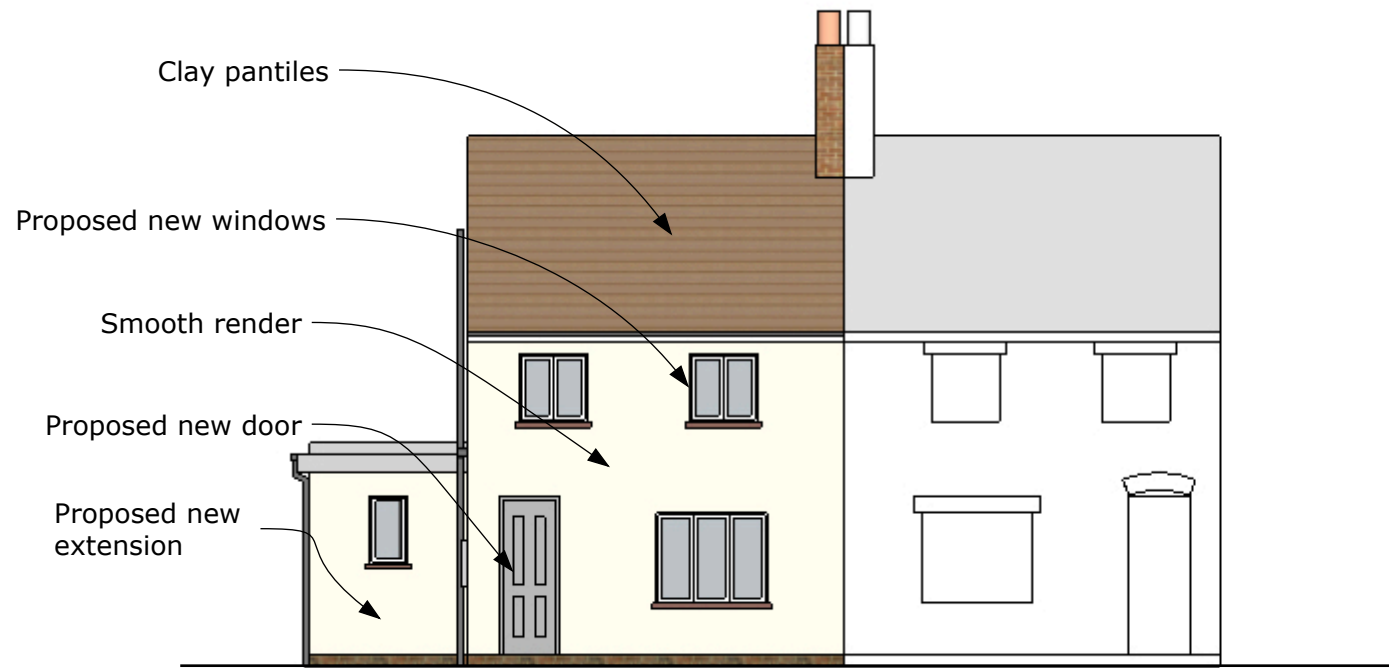
03 210 PROPOSED EAST ELEVATION