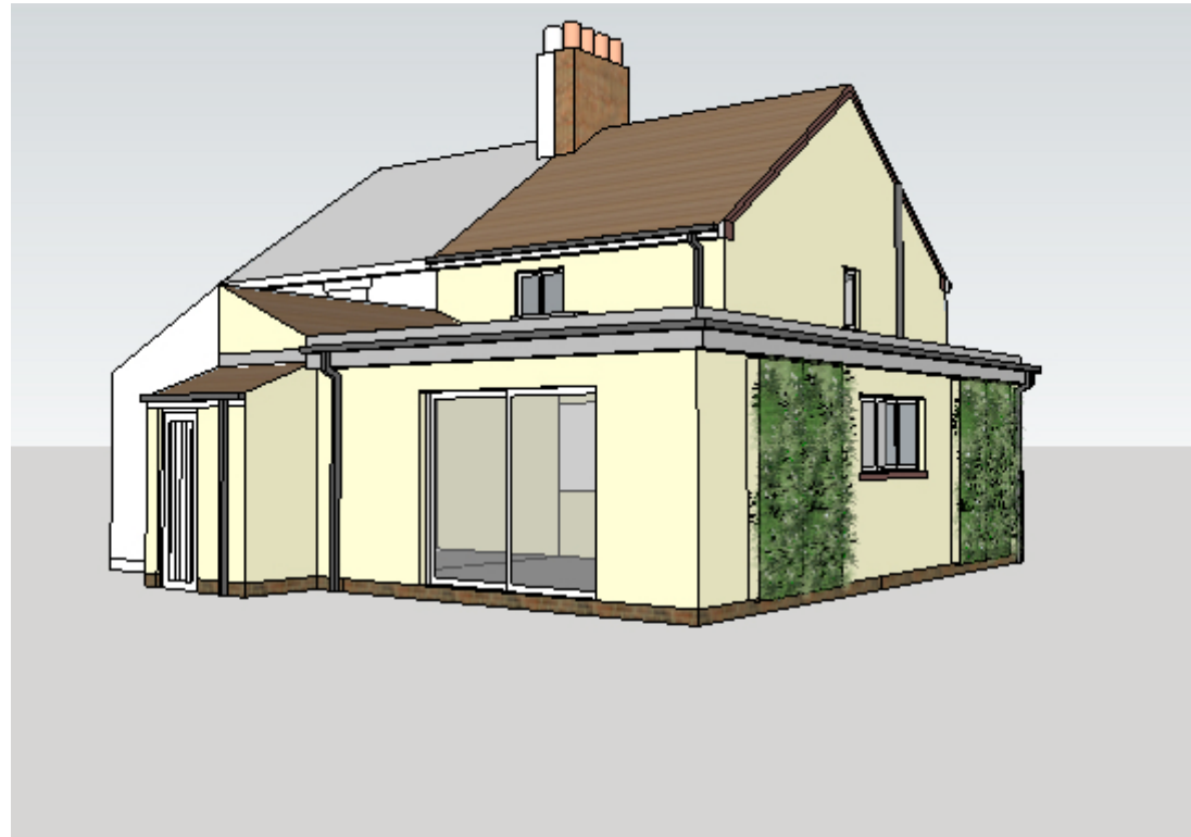
04 210 PROPOSED VIEW FROM SOUTH WEST