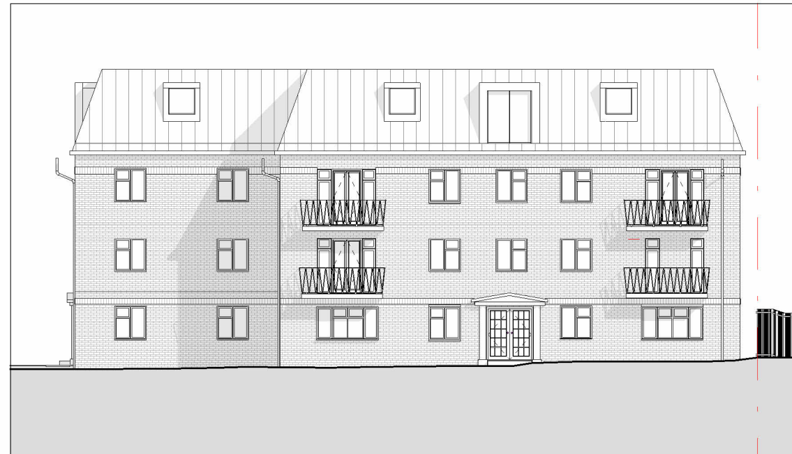
01 - Proposed North Elevation 3