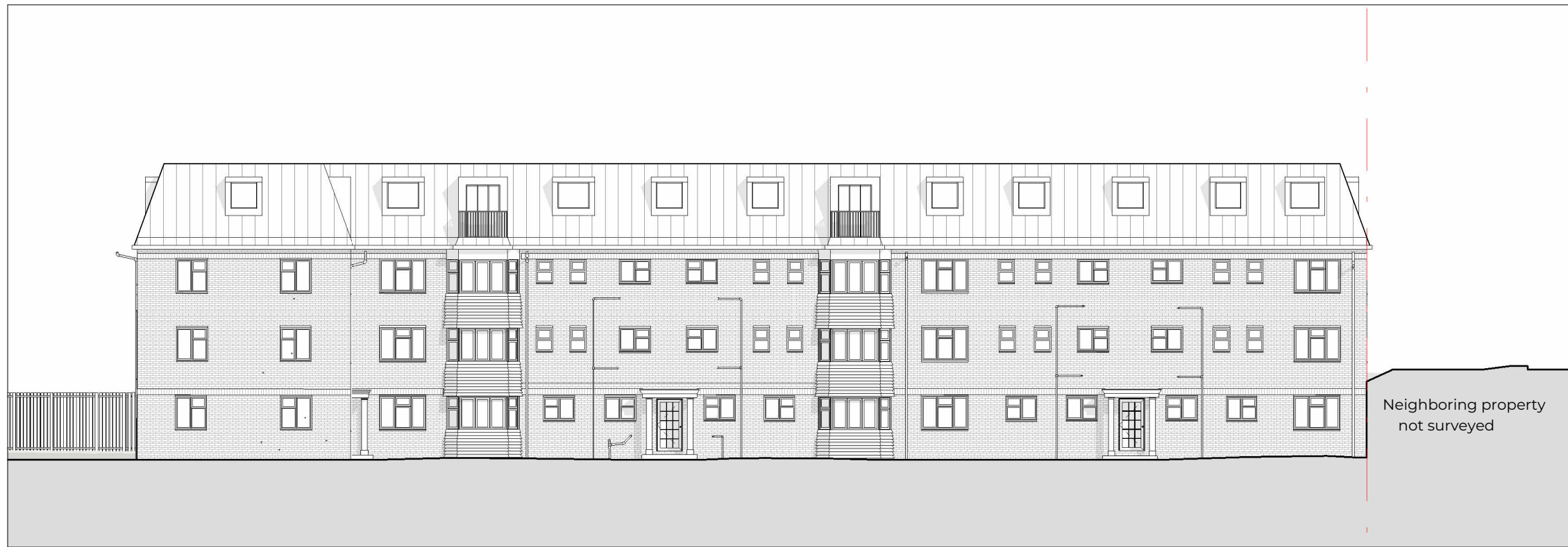
01 - Proposed North Elevation