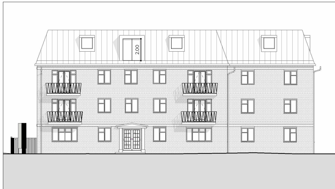
01 - Proposed North Elevation 2