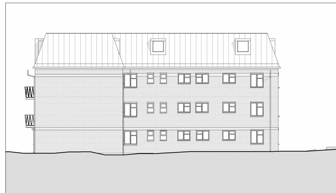
03 - Proposed West Elevation 3