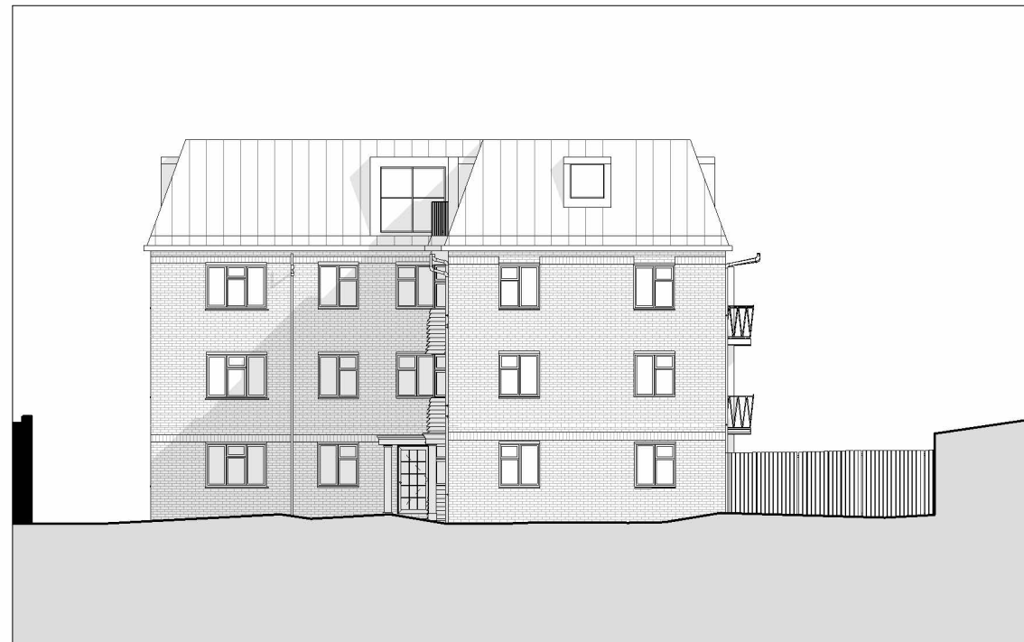
03 - Proposed West Elevation