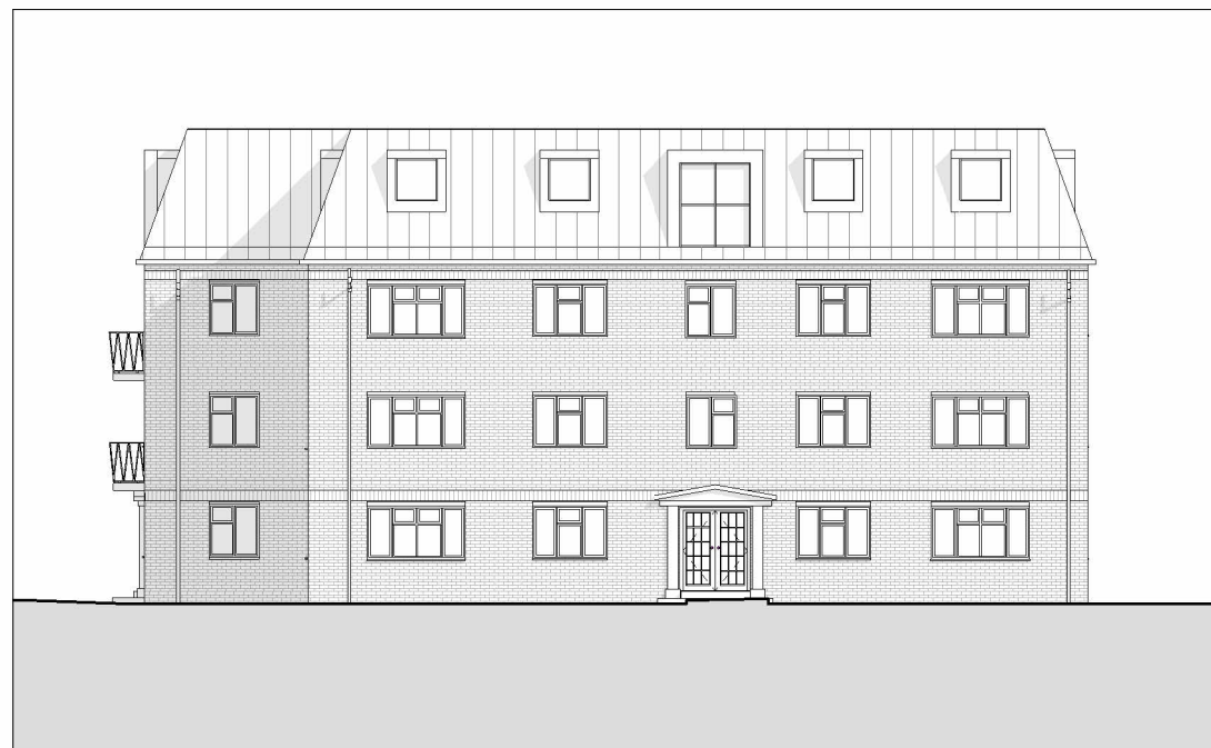
03 - Proposed West Elevation 2