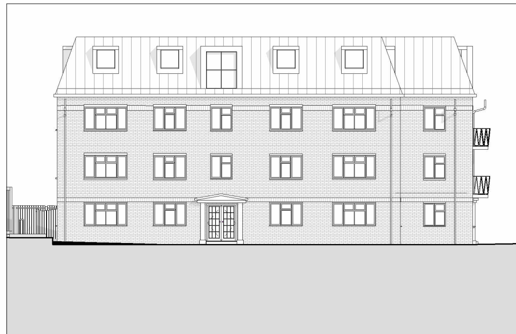
02 - Proposed East Elevation 3