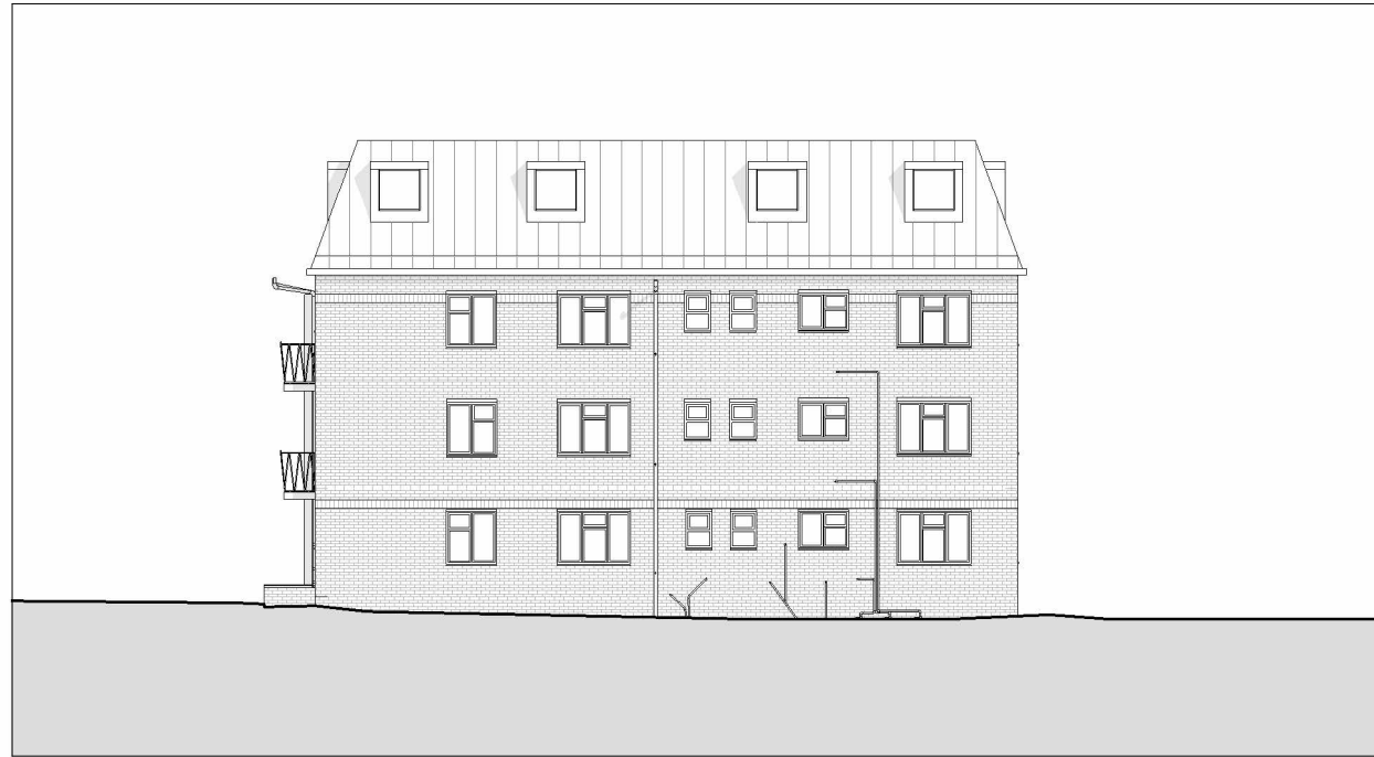
02 - Proposed East Elevation