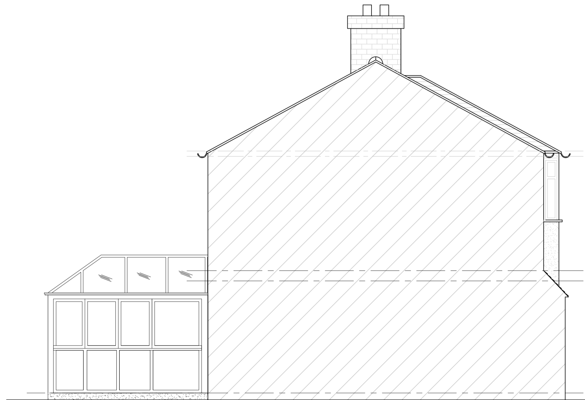
EXISTING SIDE (SOUTH) ELEVATION 1:50@A1