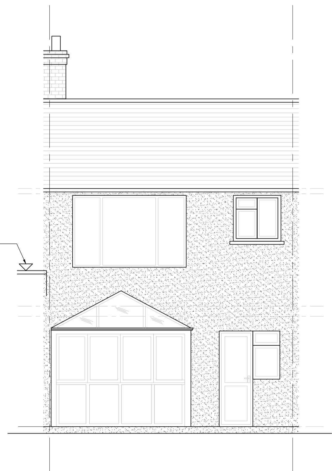
EXISTING REAR (WEST) ELEVATION 1:50@A1