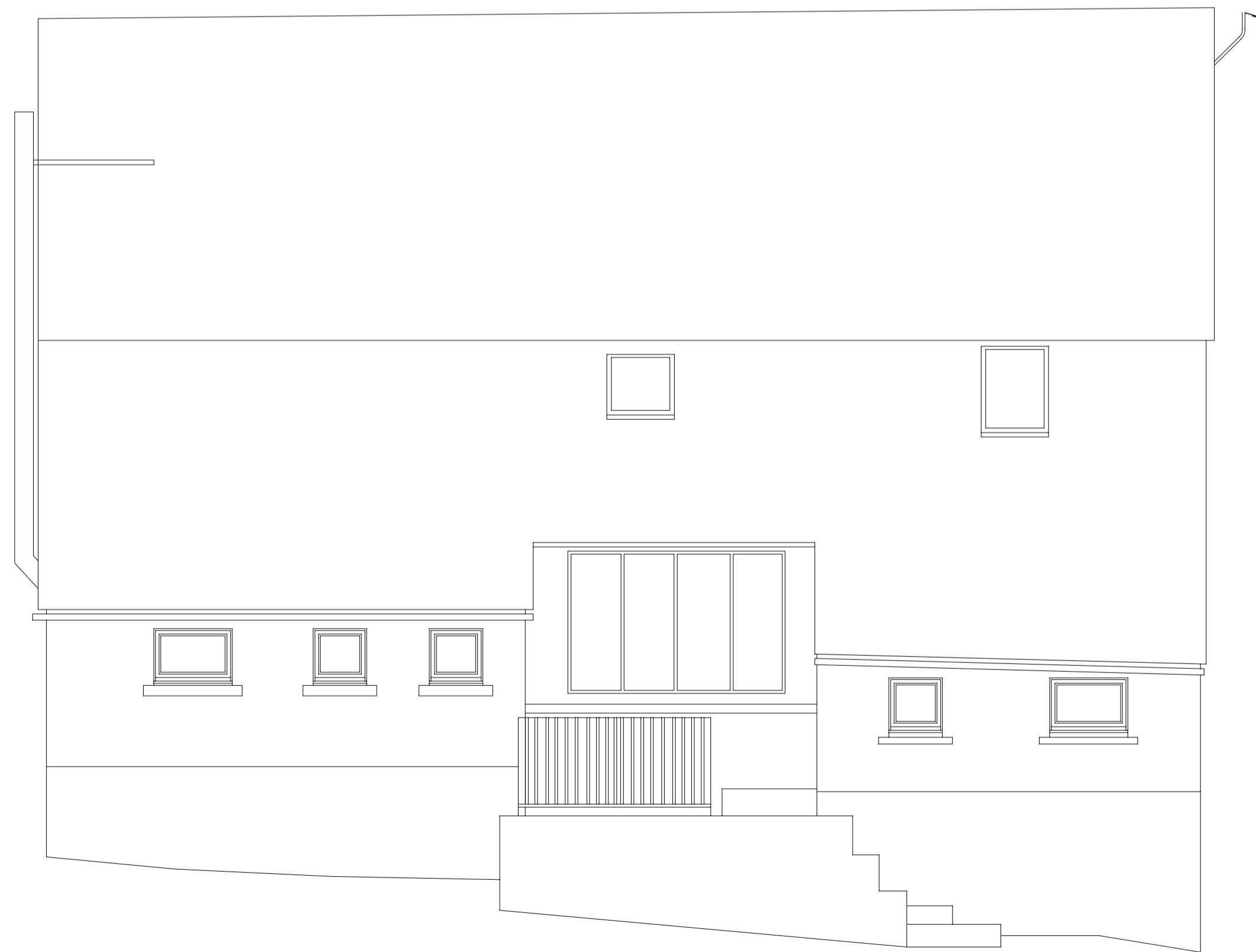
Existing East Elevation - 1/50