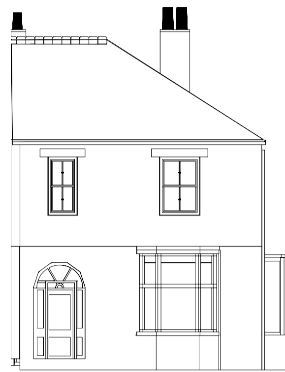
4 SOUTH WEST ELEVATION EXISTING Scale: 1:100