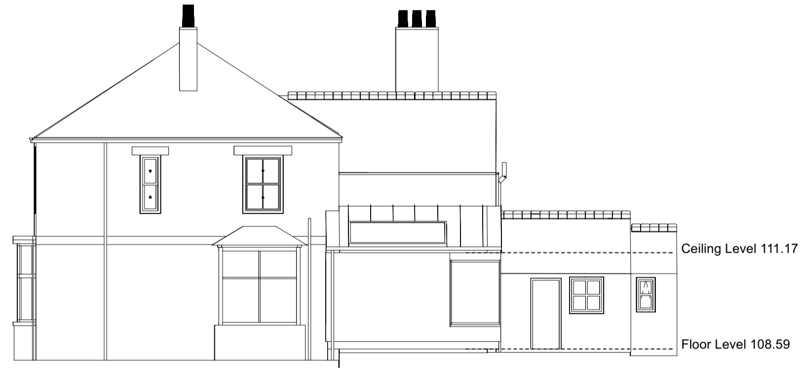
3 SOUTH EAST ELEVATION PROPOSED Scale: 1:100