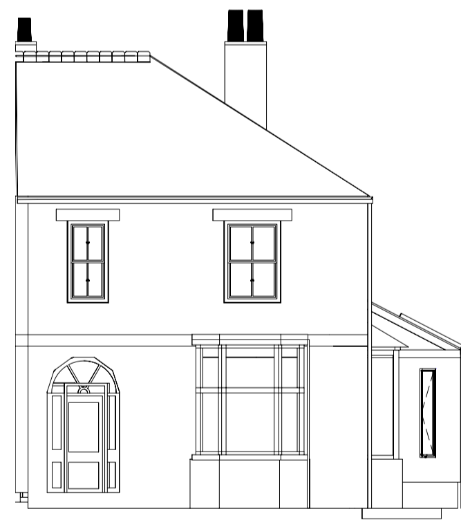
1 SOUTH WEST ELEVATION PROPOSED Scale: 1:100