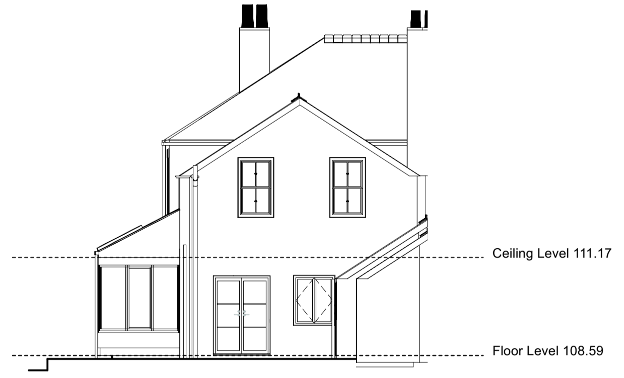
2 NORTH EAST ELEVATION PROPOSED Scale: 1:100