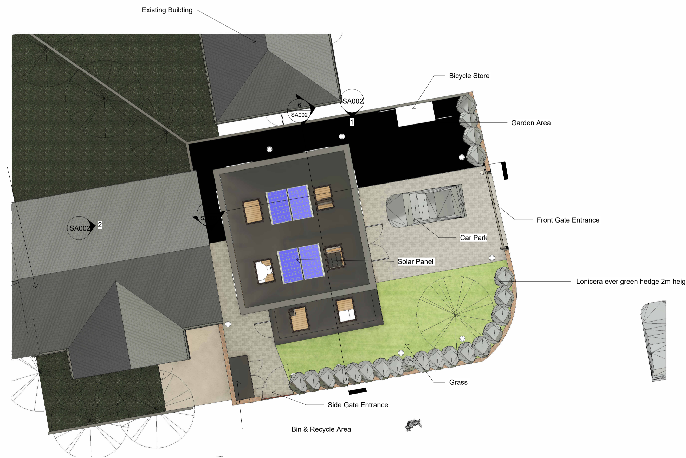
4 Site/Block Plan 1 : 100