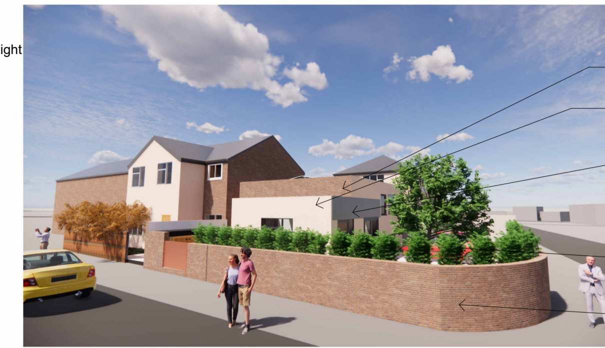
South West View