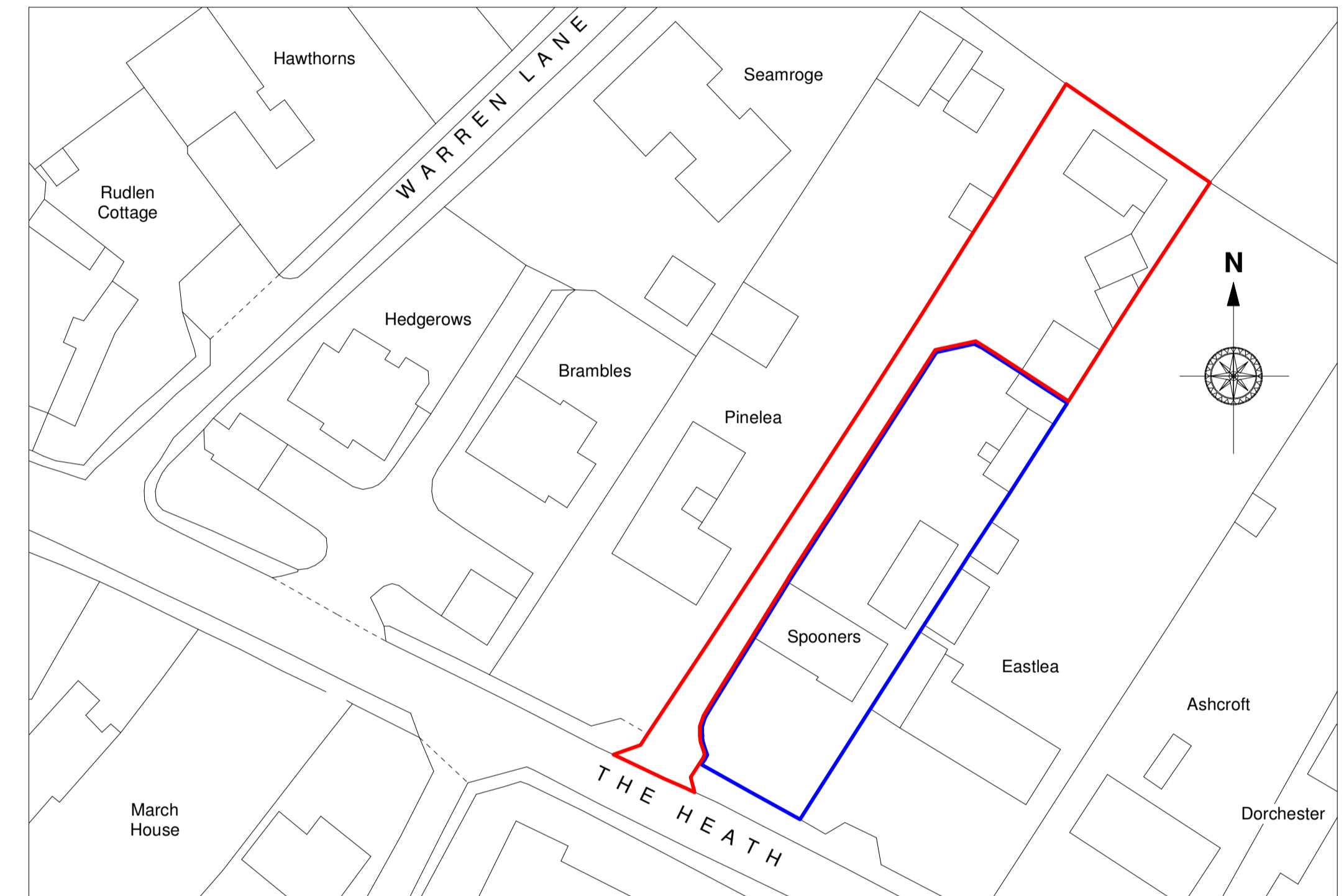
Location Plan 1:500 @ A1

Revision A 05.01.24 Planning Alterations