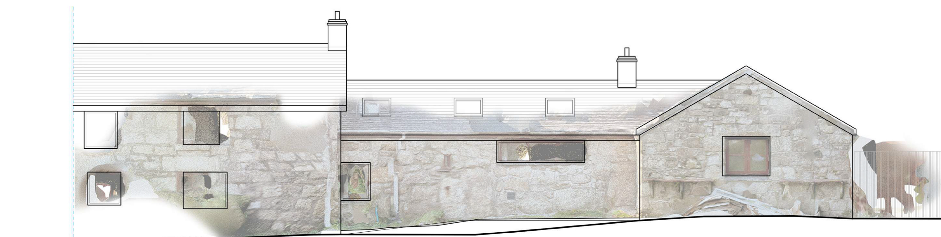
REAR ELEVATION (SOUTH EAST)