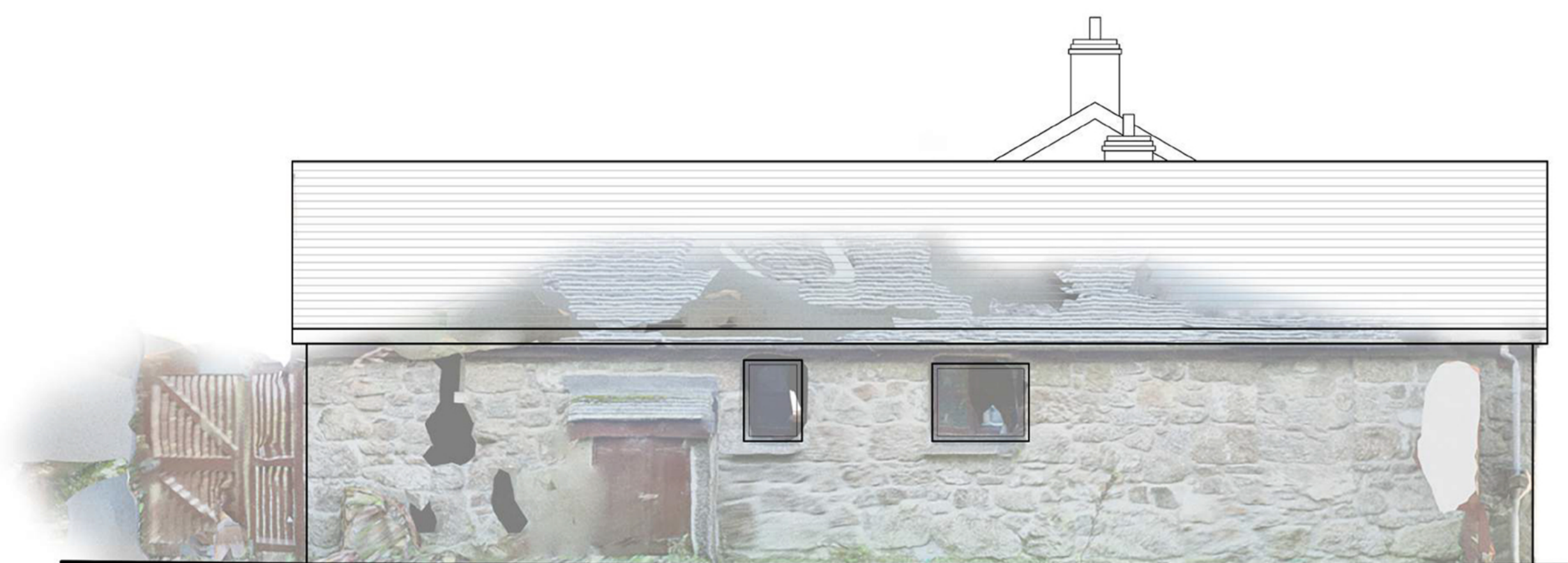
SIDE ELEVATION (NORTH EAST)