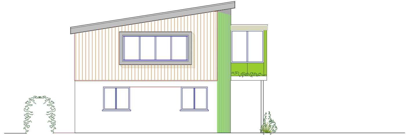
SOUTH HOUSE - East elevation