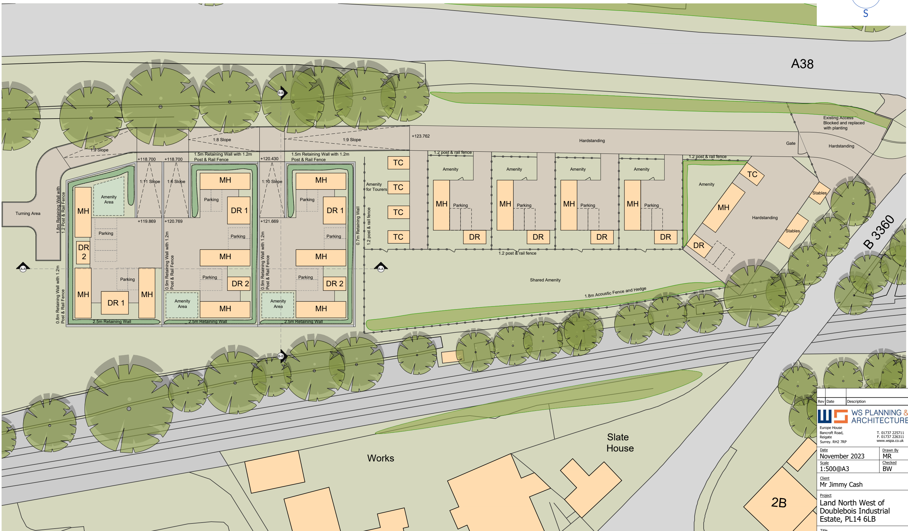
Site Plan As Proposed 1:500