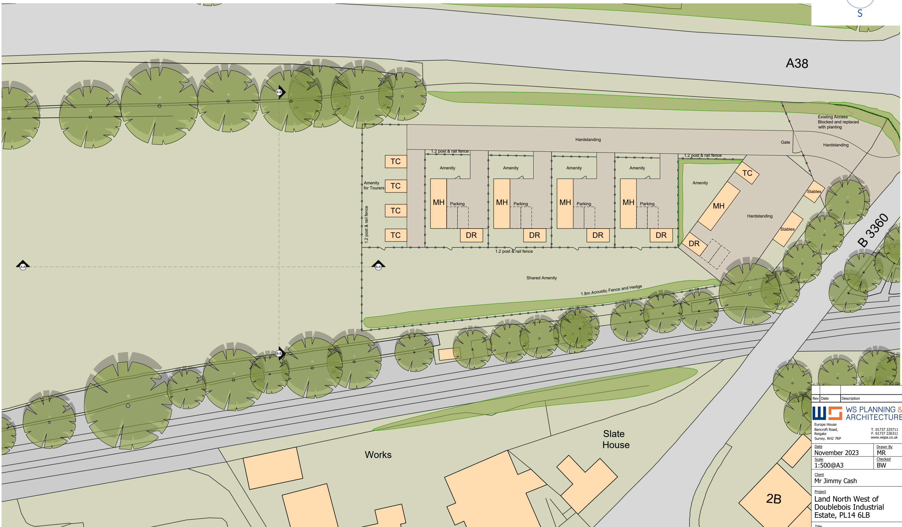
Site Plan As Existing 1:500