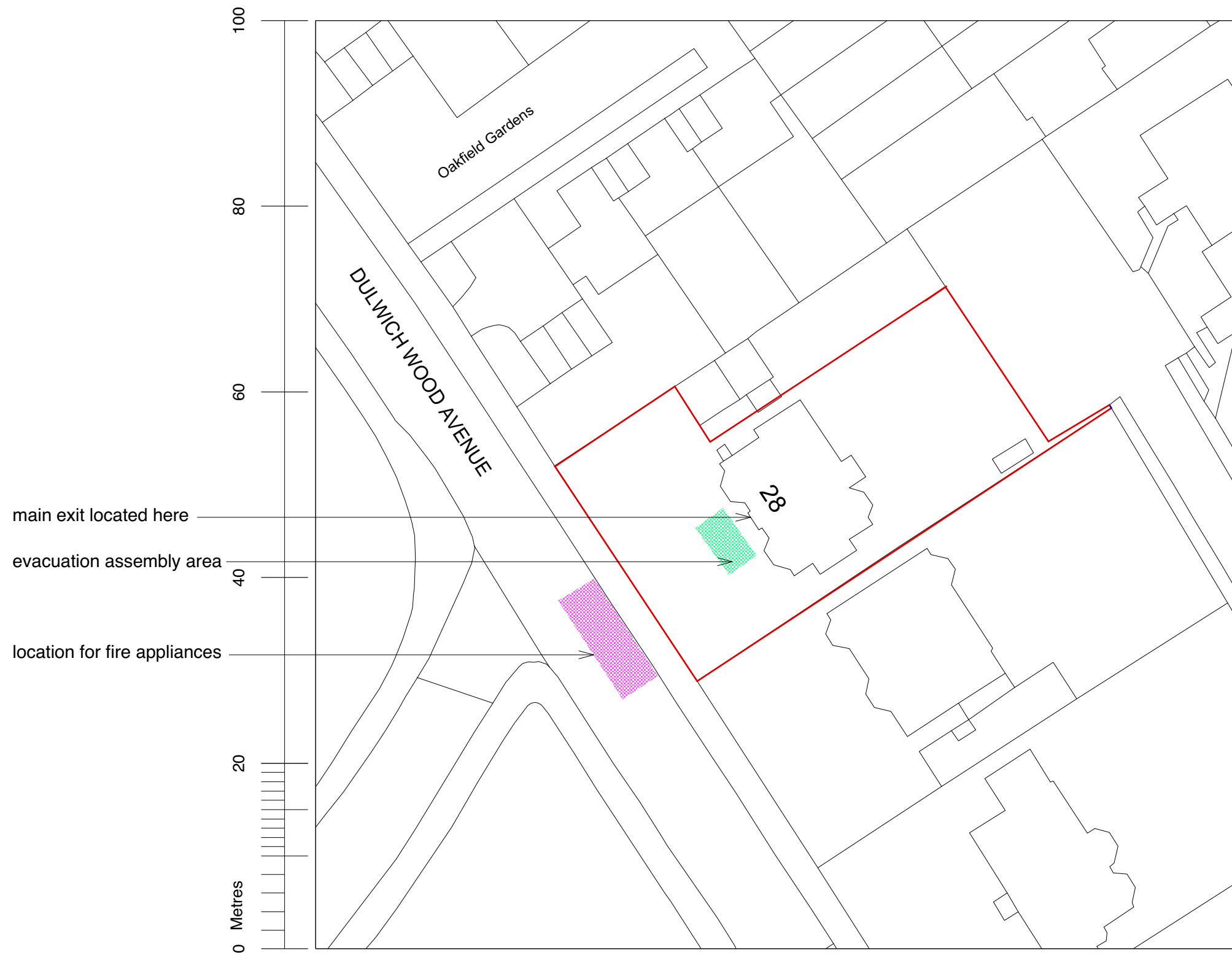
Block Plan. Scale 1:500