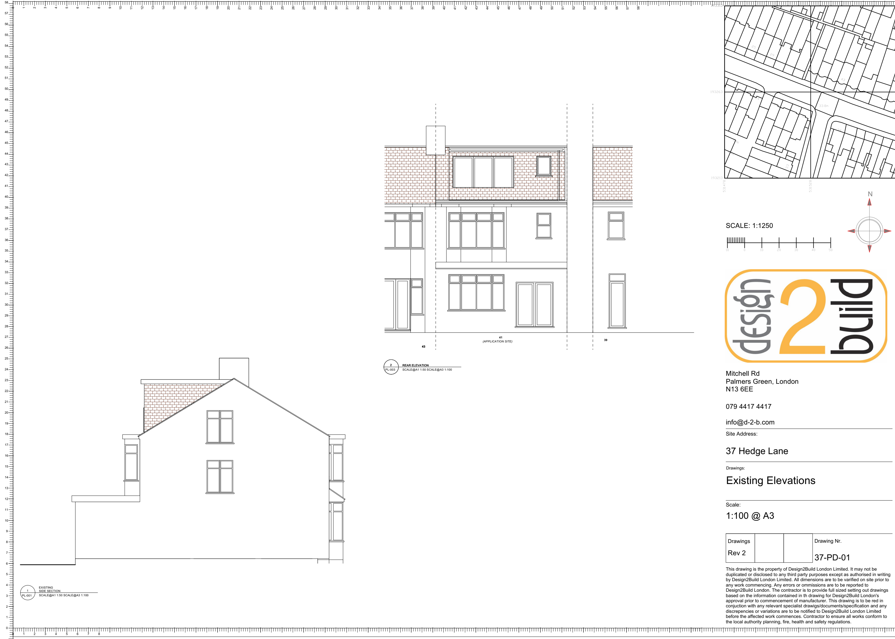
1 EXISTING SIDE SECTION PL-001 SCALE@A1 1:50 SCALE@A3 1:100